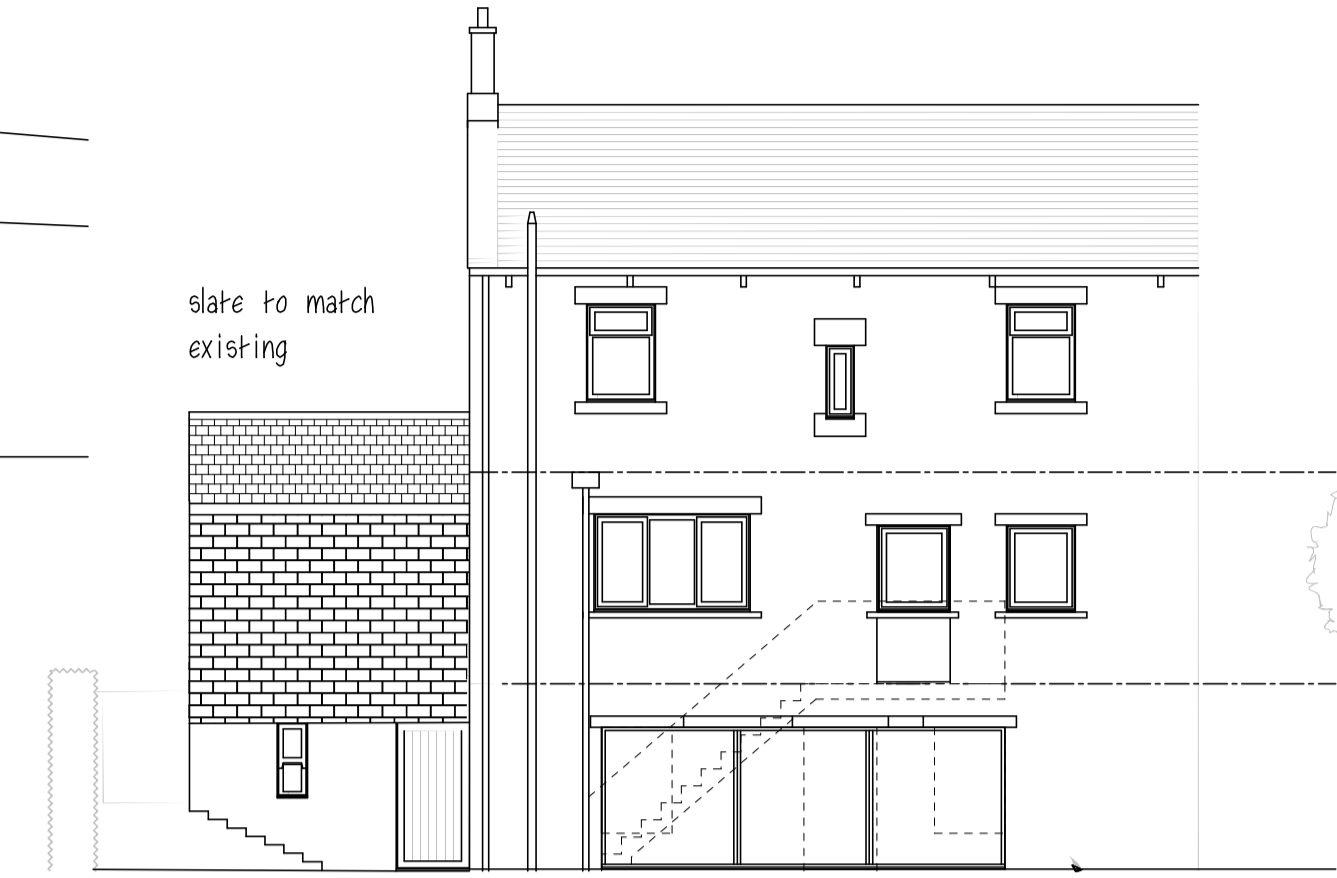
Proposed Elevations 1:100