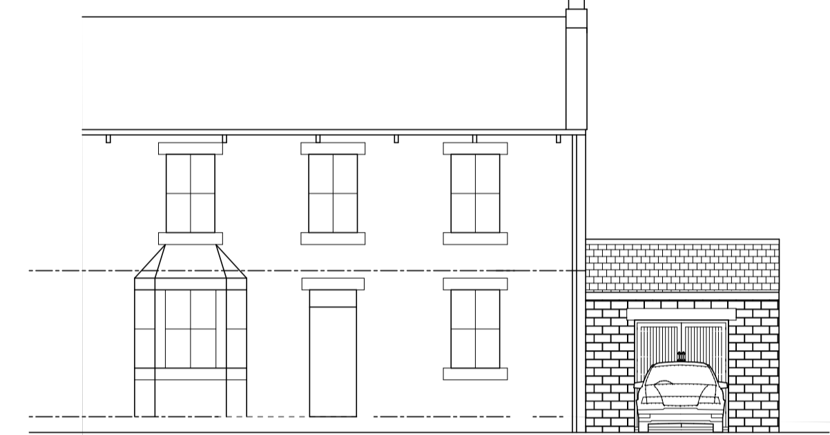
Proposed Elevations 1:100