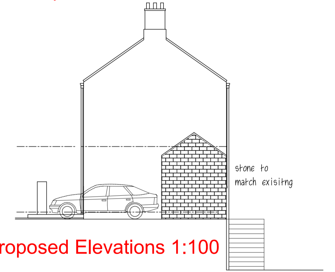
Proposed Elevations 1:100