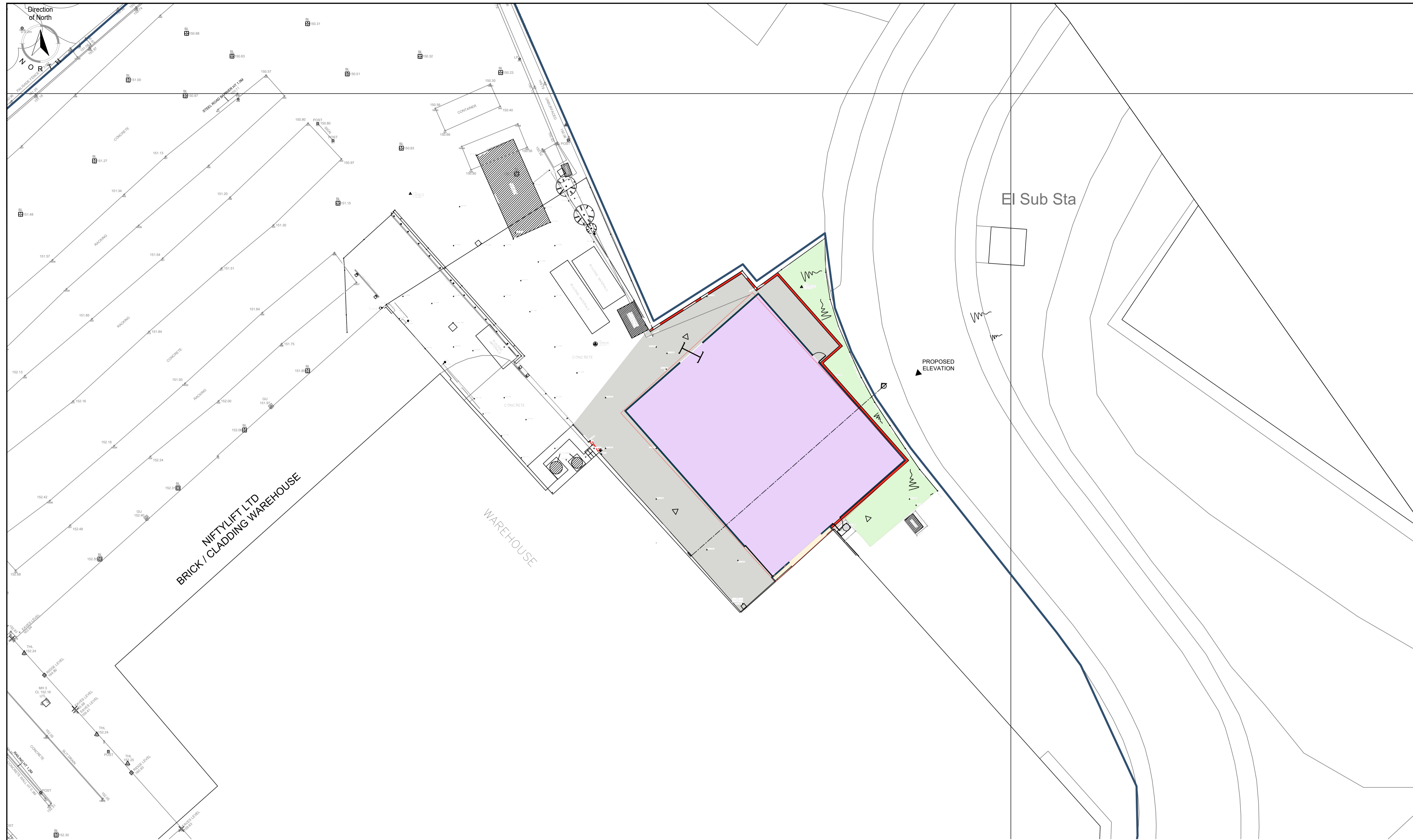
PROPOSED SITE PLAN @1:200