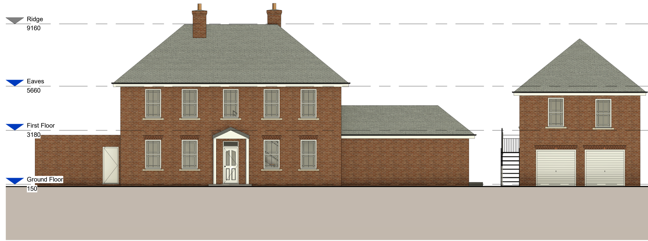
1 Existing Front Elevation (North East) 1 : 100