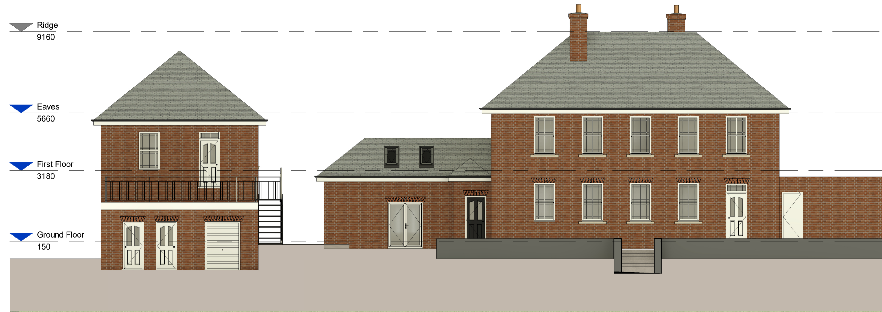
3 Existing Rear Elevation (South West) 1 : 100