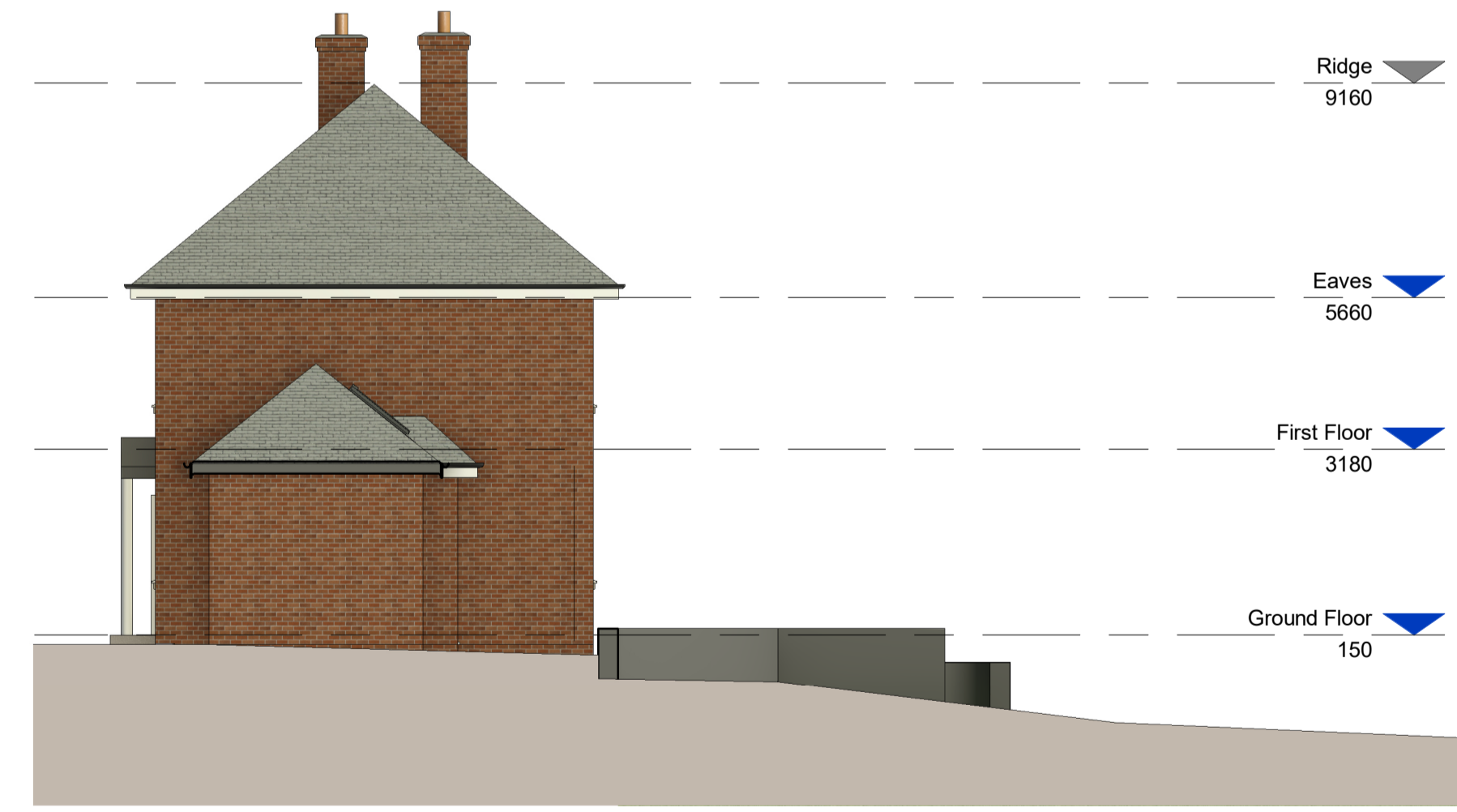
4 Existing Side Elevation (North West) 1 : 100