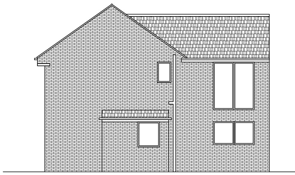
PROPOSED END ELEVATION SCALE 1:100 AT A3

DO NOT SCALE: Contractor to check all dimensions and report any omissions or errors