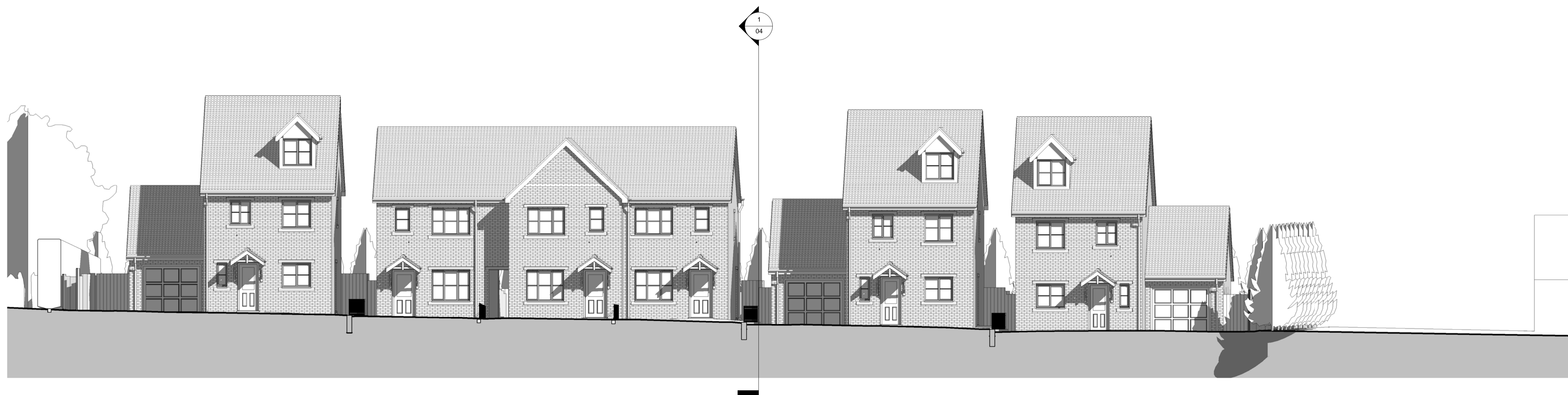
Section - B. East West Looking North - As Proposed 1 : 100