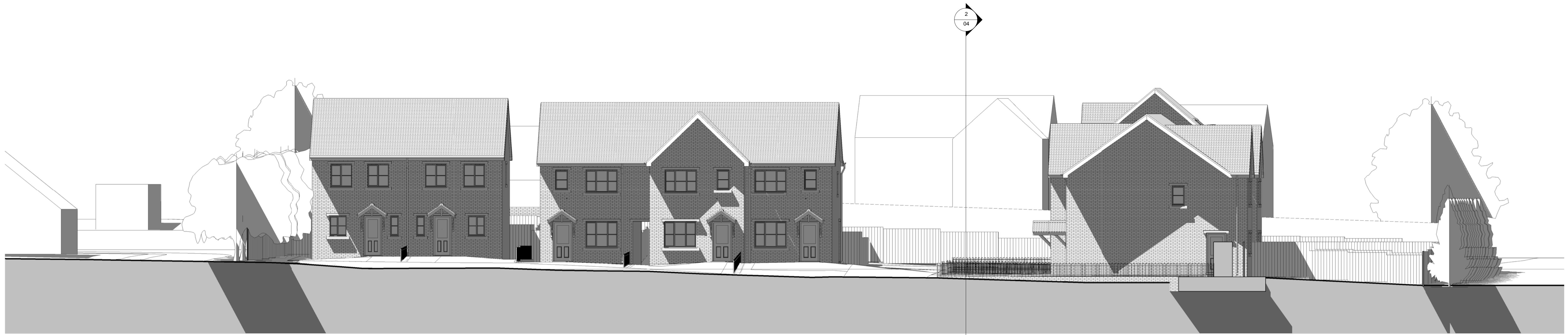
Section - A North South Looking West - As Proposed 1 : 100