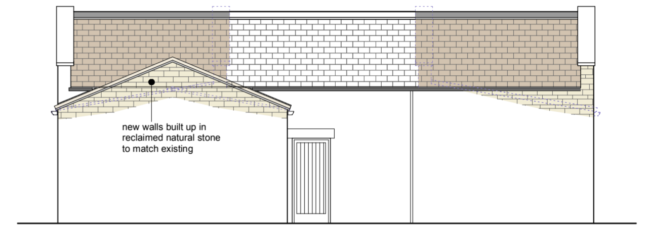
rear elevation north