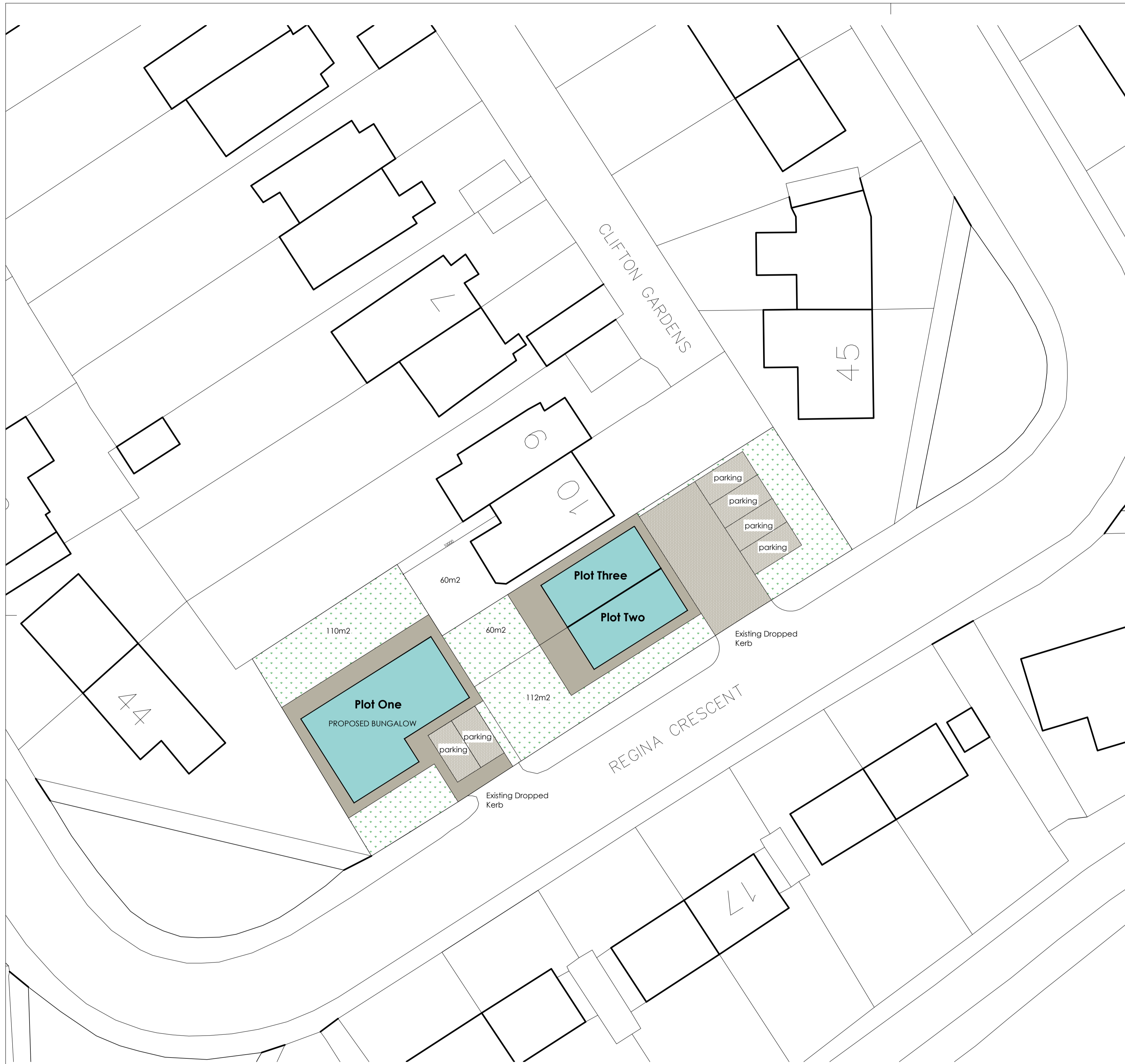
LAYOUT PLAN SCALE 1:200