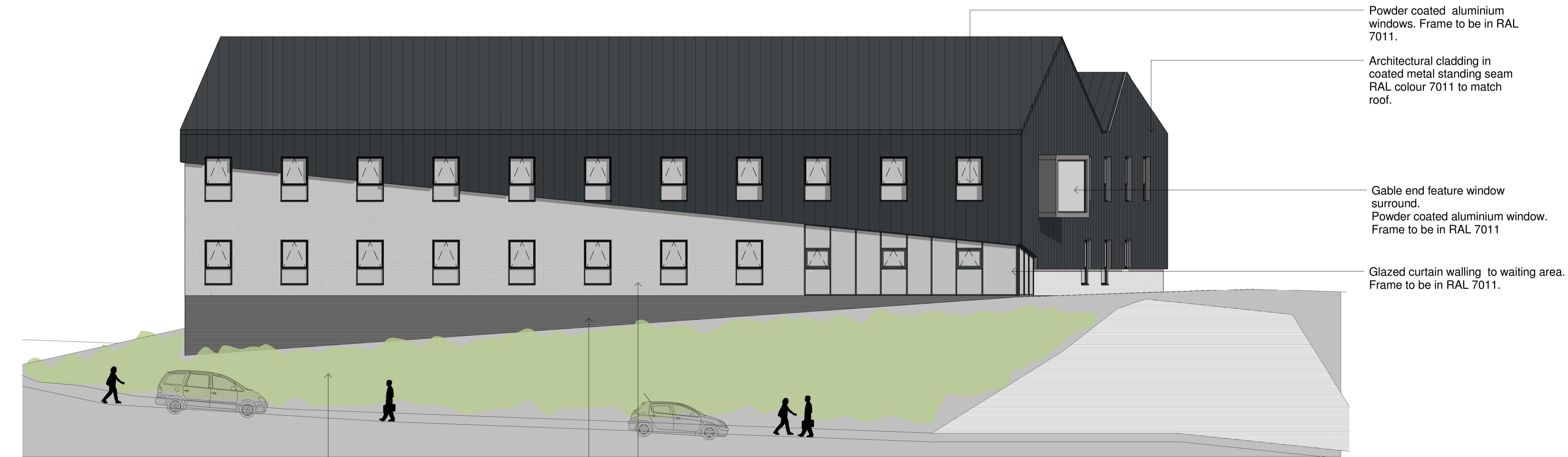
2 North East Elevation 1 : 100

Indicative line of black paladin fencing