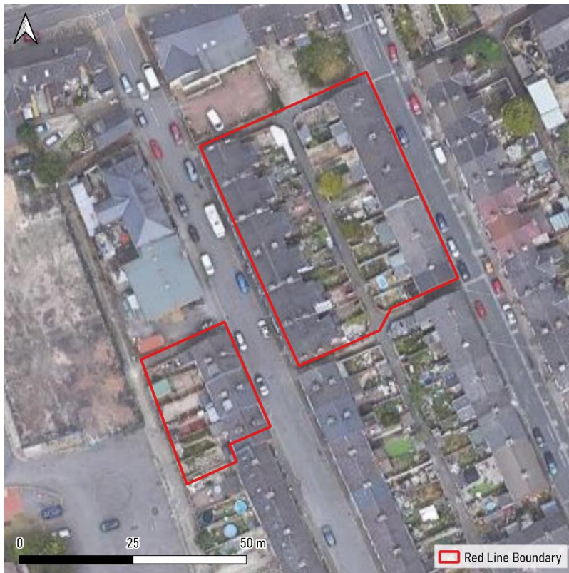
Figure 1 The surveyed building - red line