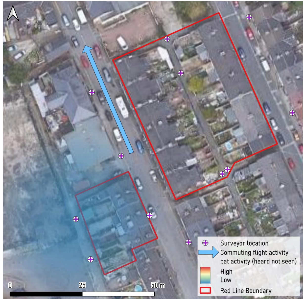
Figure 2 Summary of bat activity observed during emergence survey