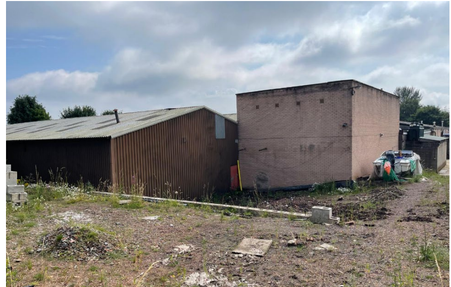
Rear Elevation (Proposed Extension Site)