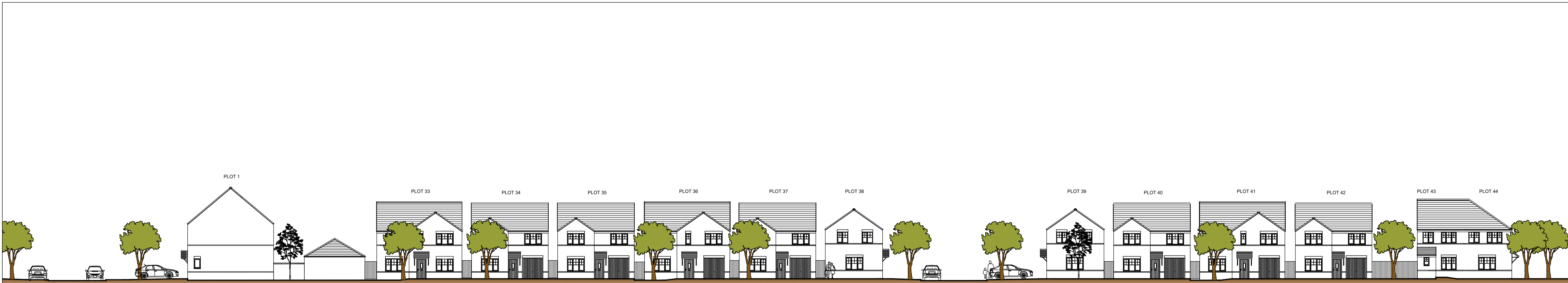
STREET SCENE A-A 1:200 - View Towards Barugh Green Lane