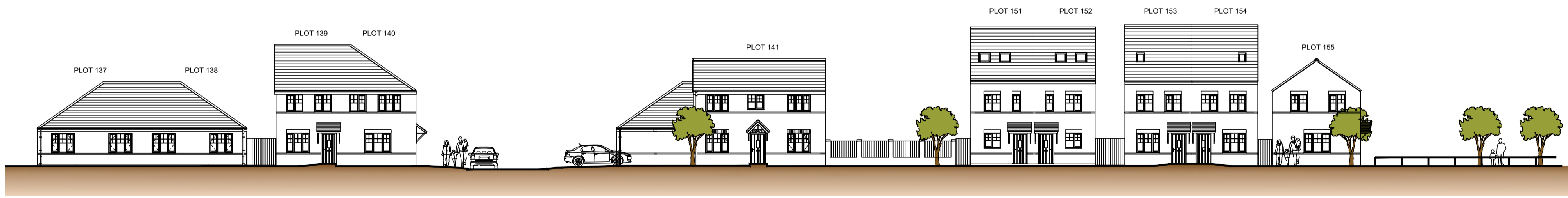
STREET SCENE C-C 1:200 - View Fronting Barugh Green Road - Open Space