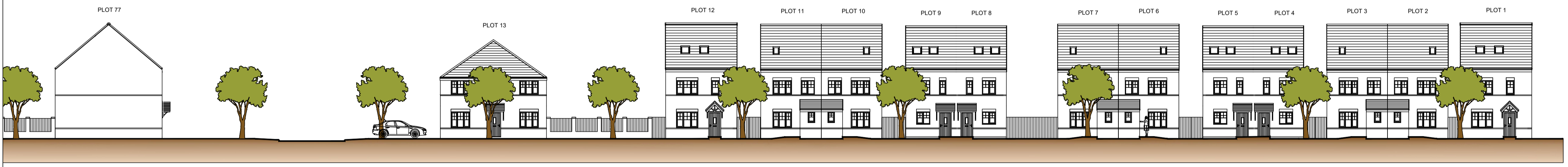
STREET SCENE B-B 1:200 - View Fronting Primary Avenue