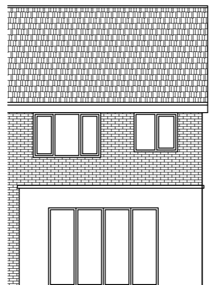
EXISTING REAR ELEVATION SCALE 1:100 AT A3