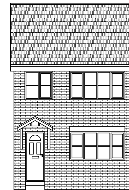
EXISTING FRONT ELEVATION SCALE 1:100 AT A3