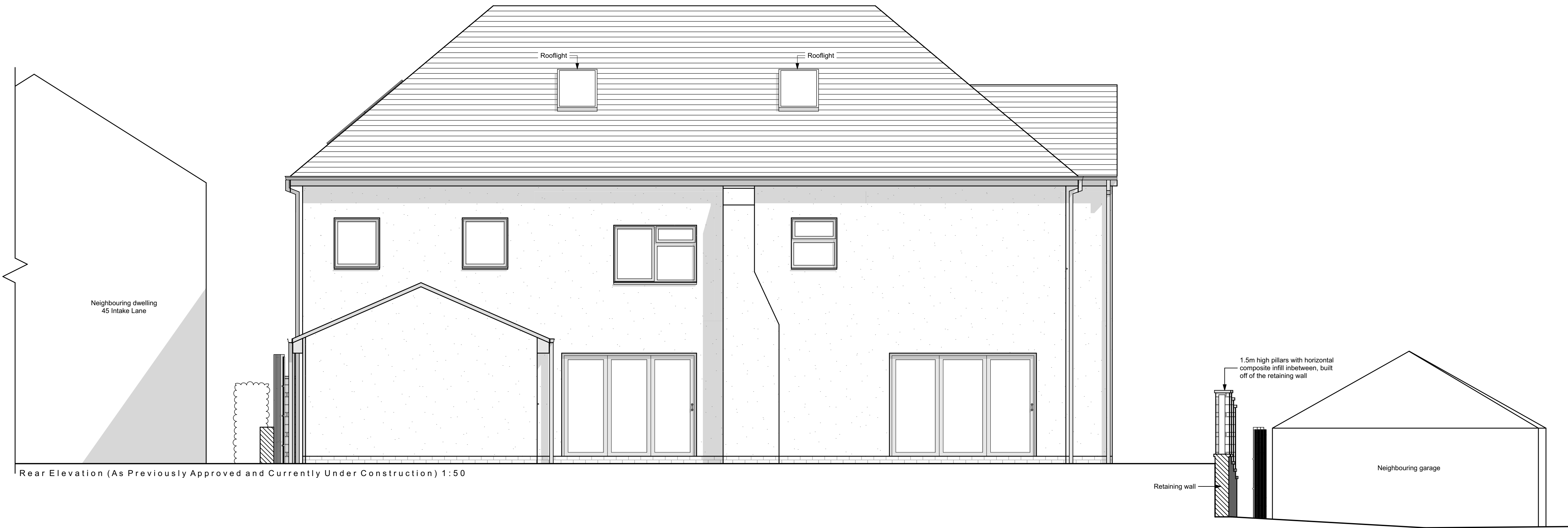
Rear Elevation (As Previously Approved and Currently Under Construction) 1:50