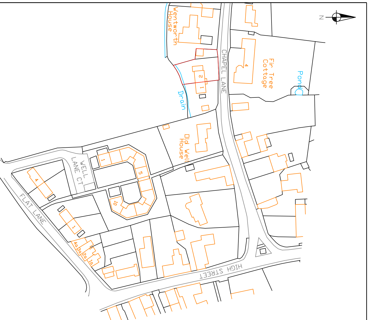
LOCATION PLAN SCALE 1=1250