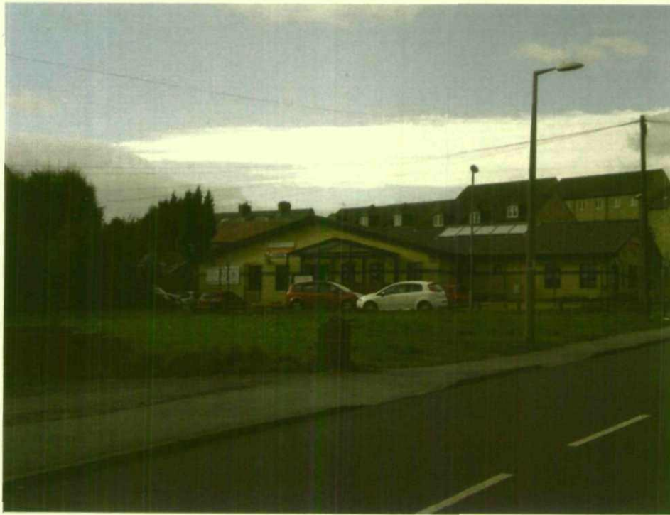
Appendix 3 – Sure Start Centre