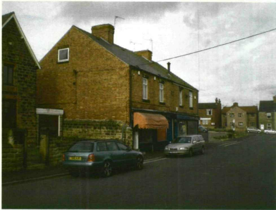
Appendix 1 – Butchers, Fish & Chip Shop and Hair Salon