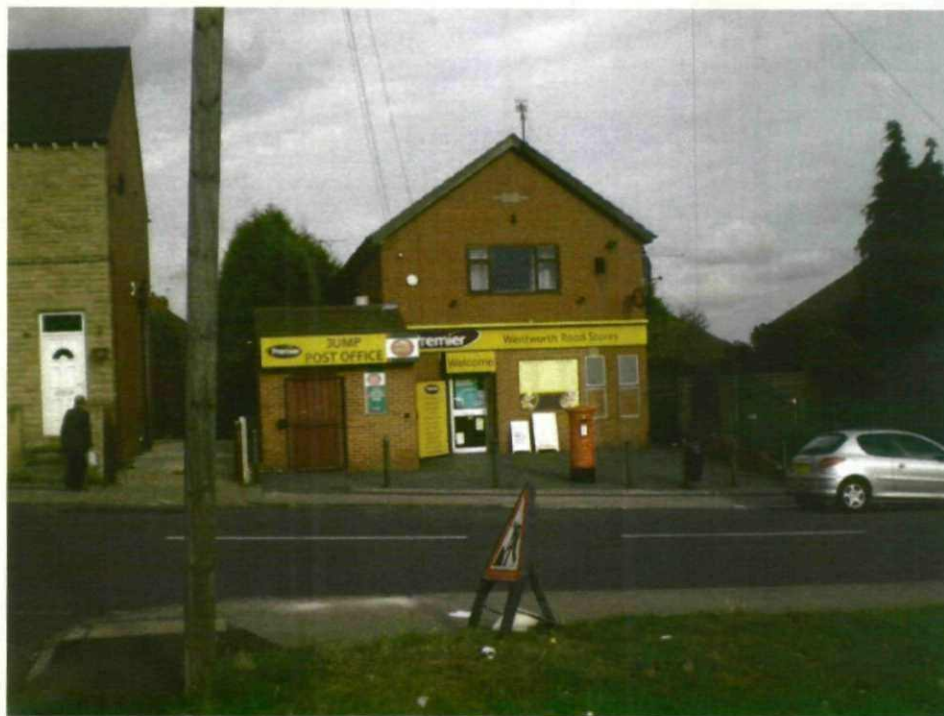
Appendix 2 - Post office and Convenience store