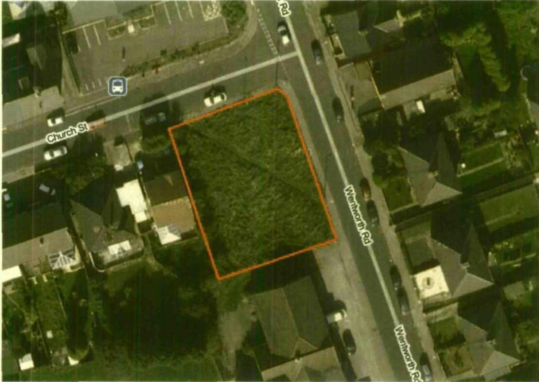
Image 1 = Image above shows Aerial photograph with approximate redline boundary shown. Approximate North on this picture is pointing straight up (see location plan for details)