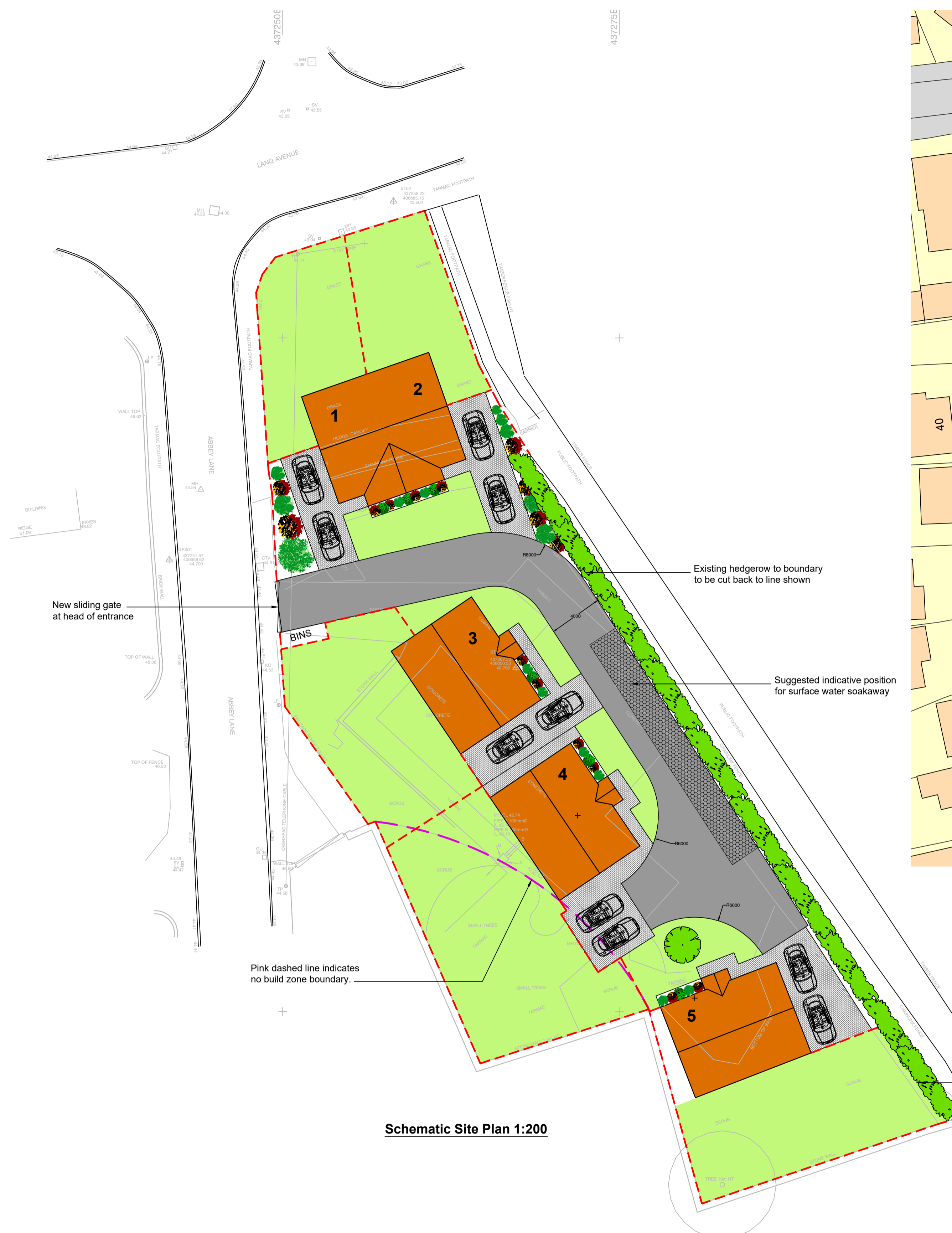
Schematic Site Plan 1:200

Foul water drainage is to discharge into the existing public foul sewers located in Abbey Lane Surface water drainage to discharge into new soakaway construction within private driveway as shown.