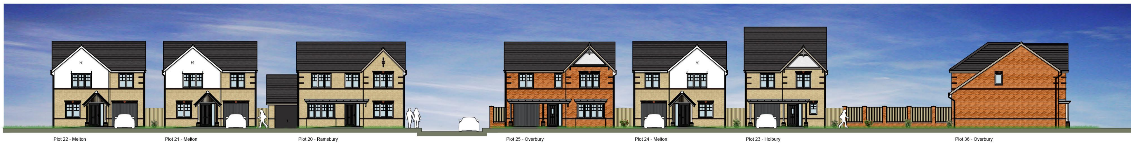
STREET SCENE A-A @ 1:200