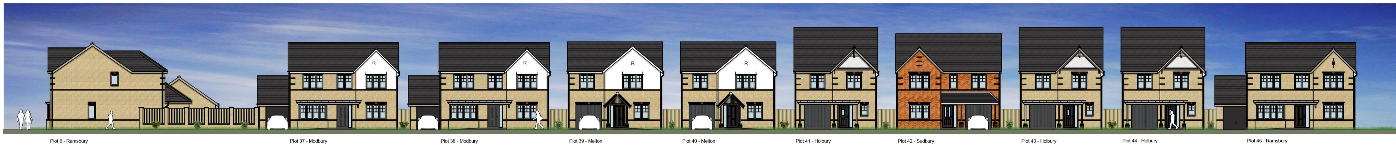
STREET SCENE B-B @ 1:200