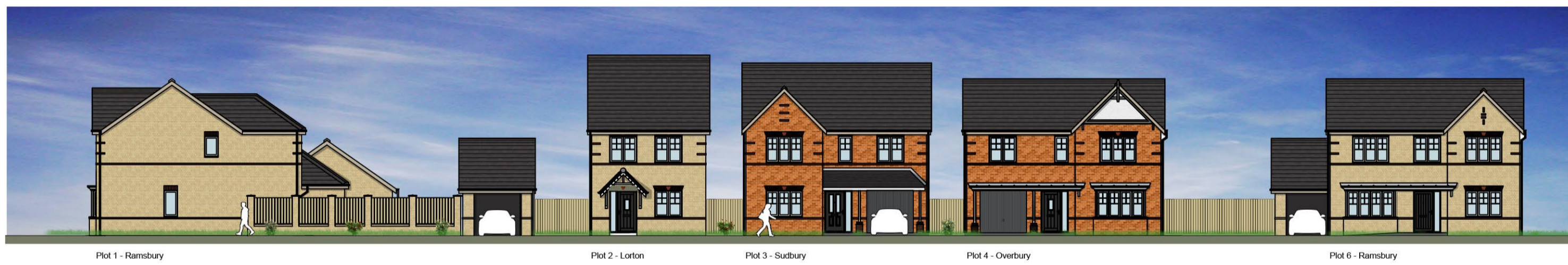
STREET SCENE D-D @ 1:200