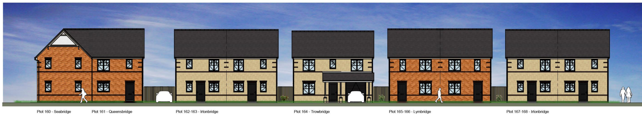
STREET SCENE C-C @ 1:200