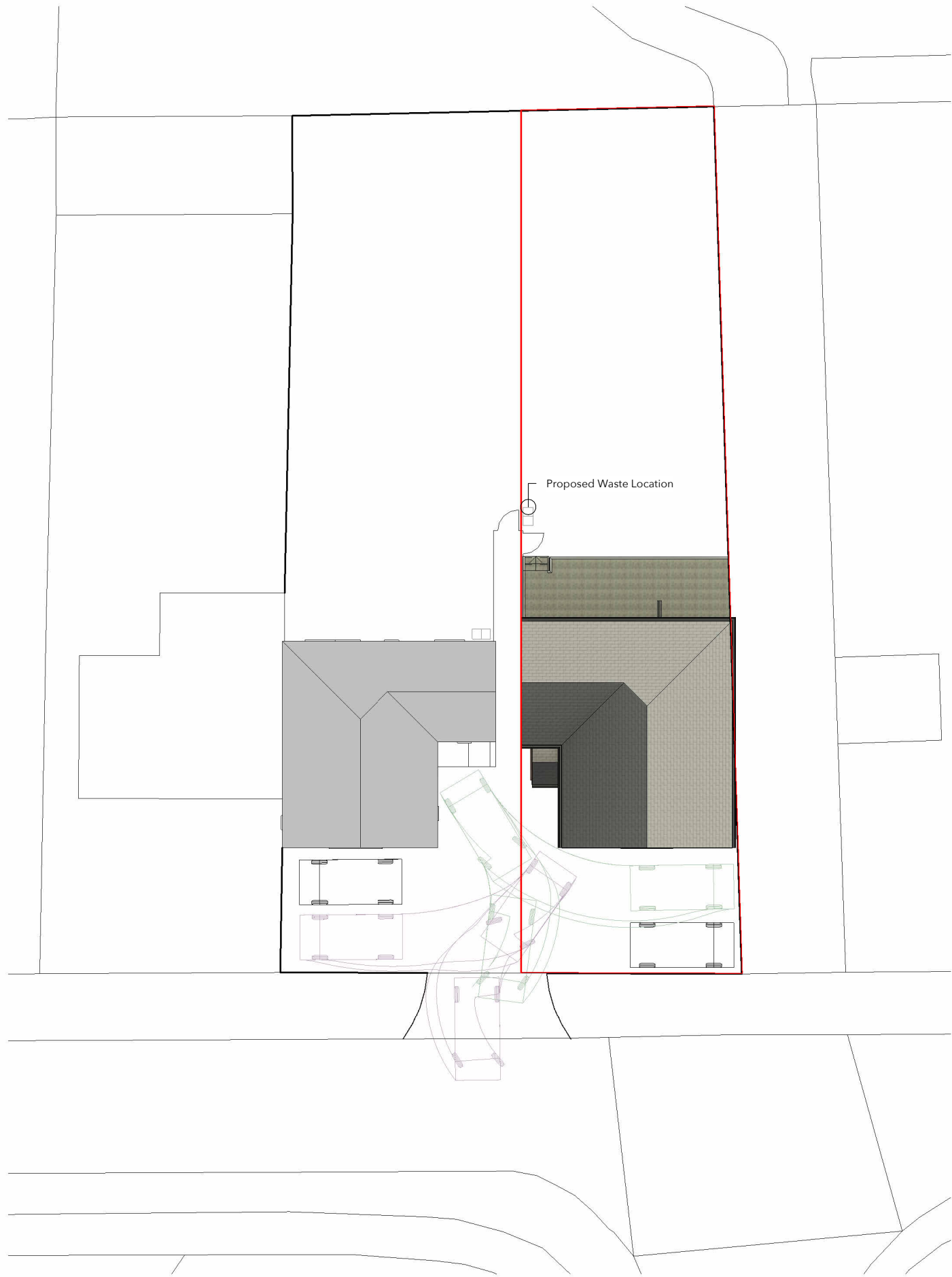
Site Plan 1 : 200