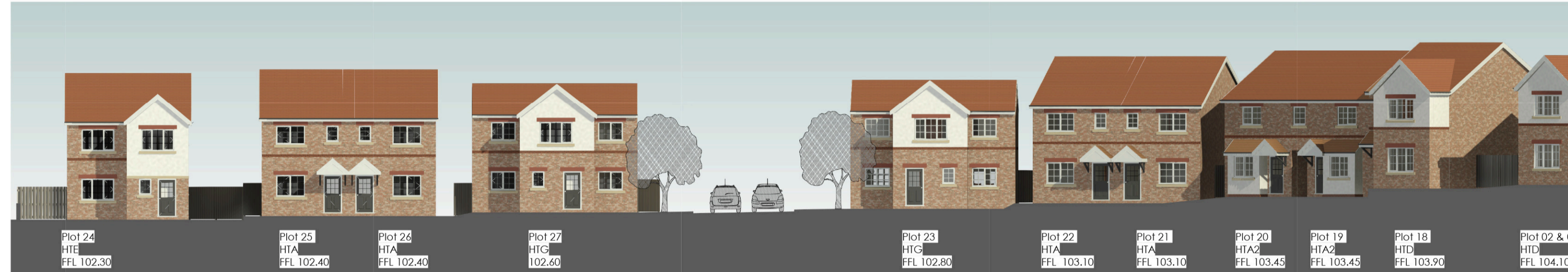
04 Section DD - Plots 01 & 02,18 - 24 1 : 200