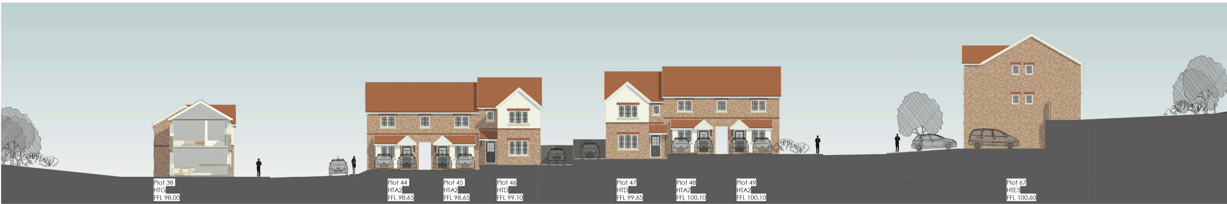
05 Section EE - Plots 38, 44 - 49 & 67 1 : 200