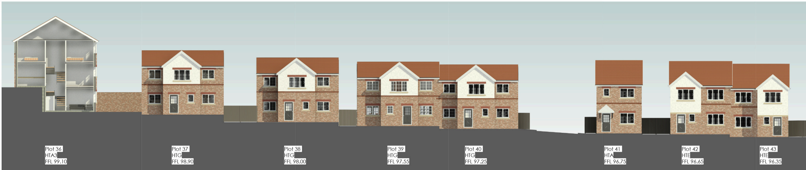
06 Section FF - Plots 35 - 43 1 : 200