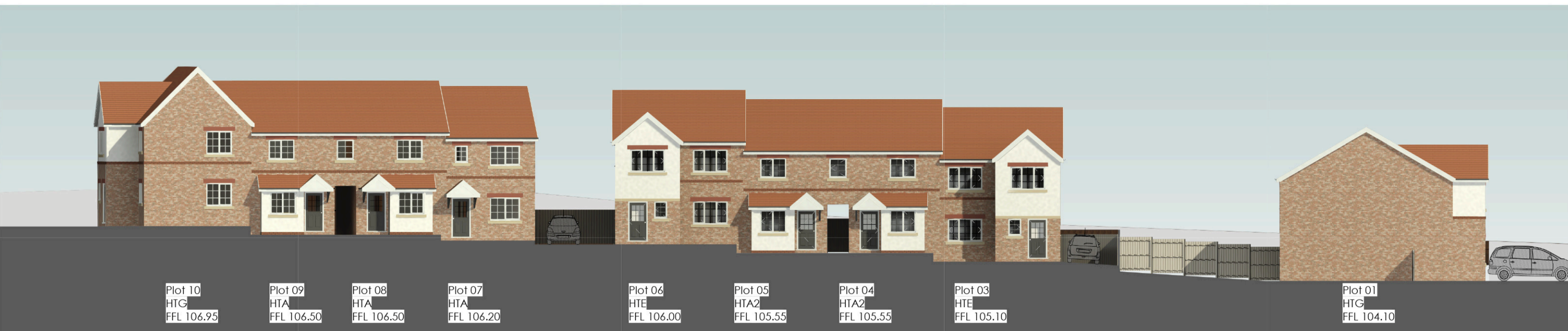
01 Section AA - Plots 01 - 10 1 : 200