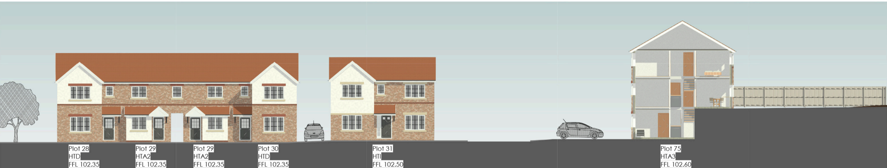
03 Section CC - Plots 12, 27 - 31 1 : 200