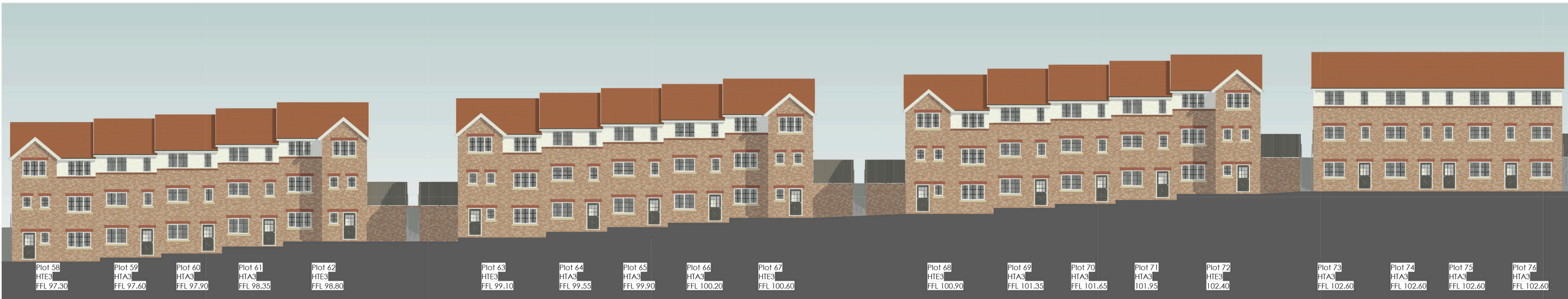
07 Section HH - Plots 58 - 76 1 : 200