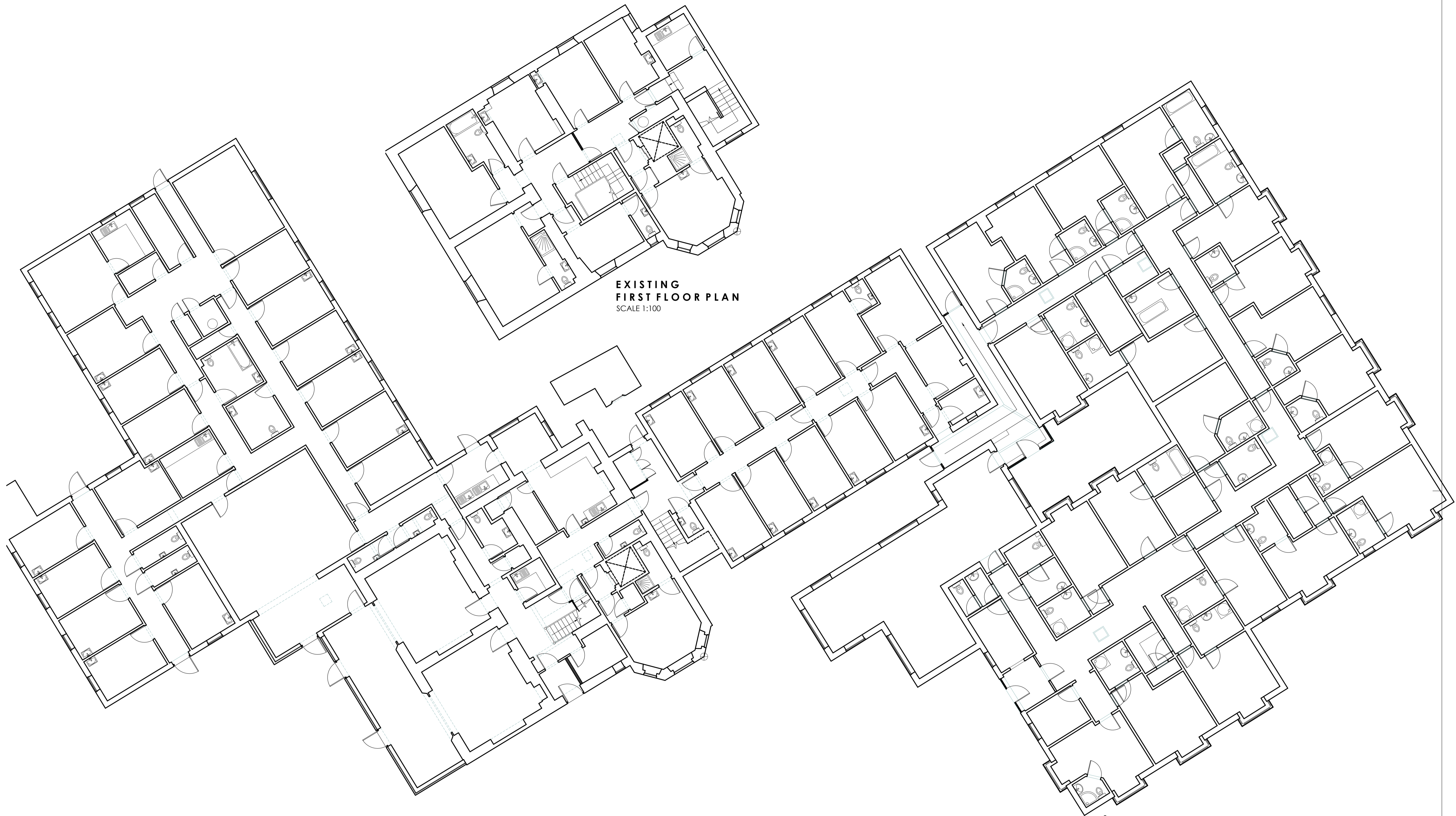
EXISTING FIRST FLOOR PLAN SCALE 1:100