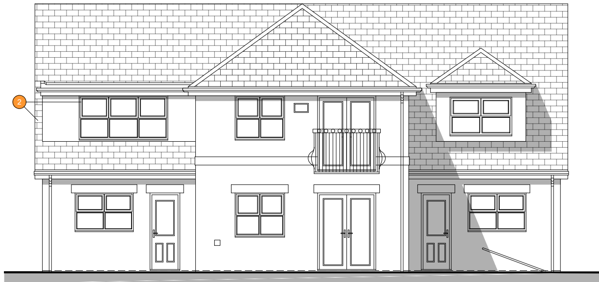
North Elevation As Proposed