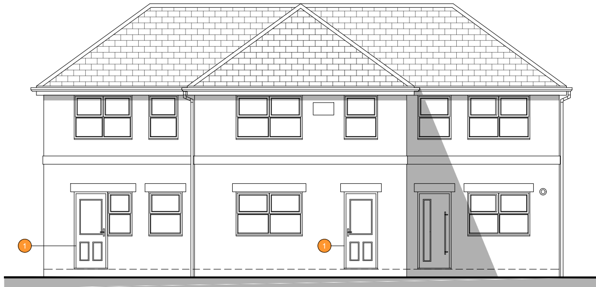
South Elevation As Proposed