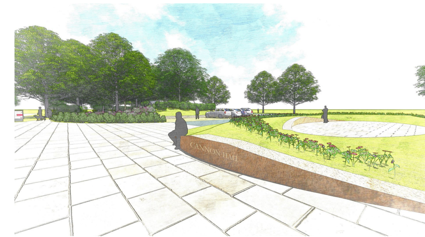
4. Views driving into proposed disabled parking