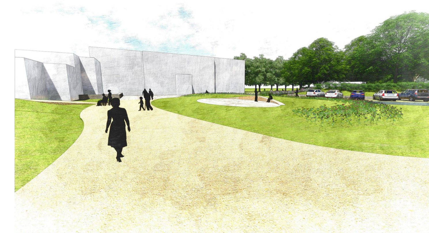
3. Exiting the hall with views onto interpretive seating