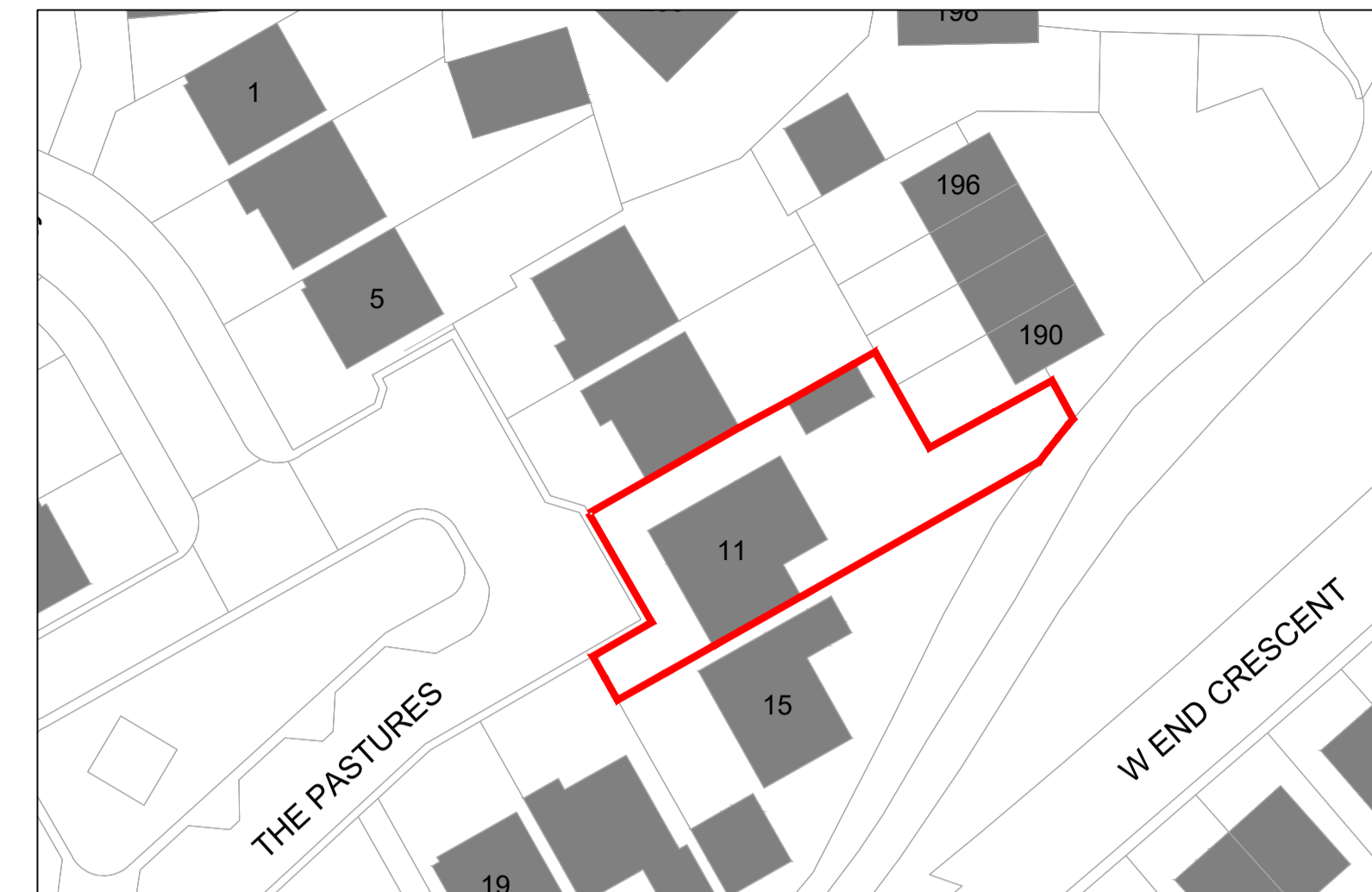
Existing Site Plan Scale - 1:500 Applicant's site boundary edged in Red. Map Number: TORQM2209114116210

NOTES Drawing may not be copied without prior written permission. This drawing is copyright. All works are to be carried out in accordance with all latest and relevant CDM Regulations, the Health and Safety Guidelines, Legionella Guidelines, Water Authority Regulations and the Building Regulations. All dimensions shown are in millimeters, unless otherwise stated. Drawing author to be notified of any discrepancies. Verify relevant drawings on site before commencing work or preparing shop drawings. Contractor to check all dimensions and report all errors and omissions to the designer. Do NOT scale from this drawing. When removing or disturbing any existing material, check all items that are to be disturbed for any trace of asbestos. Do not mechanically fix into asbestos based materials. Remove all asbestos in accordance with government guidelines. Check the 'Demolition & Refurbishment' Asbestos Survey prior to commencement of all works. All removals to be carried out by an accredited contractor. Not Architectural Designers responsibility to obtain Asbestos R&D Survey.