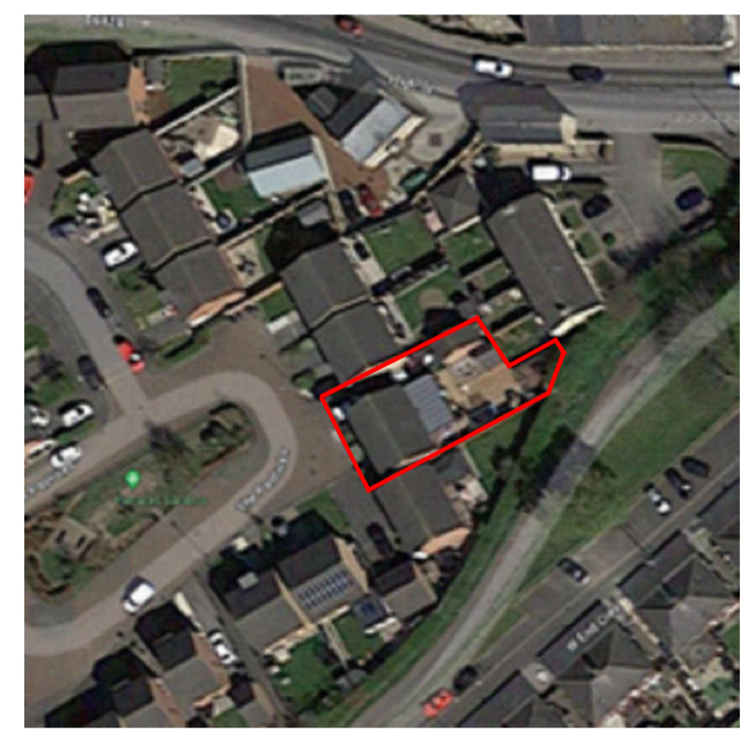
AERIAL IMAGE