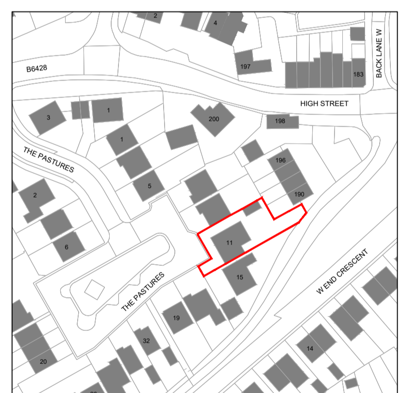
Existing Block Plan Scale - 1:1250 Applicant's site boundary edged in Red. Map Number: TORQM2209114116210