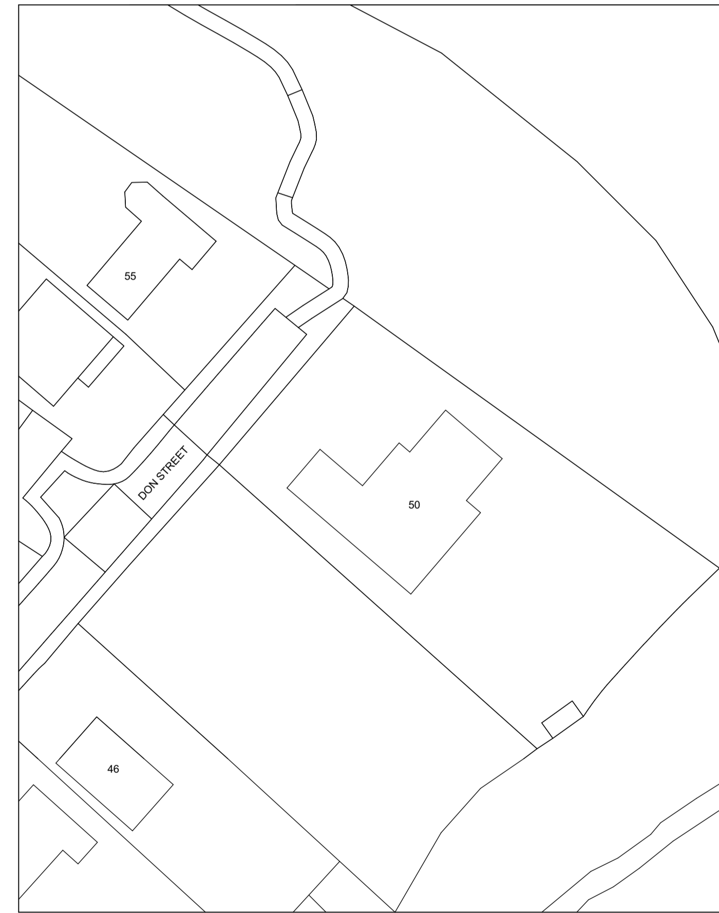
Site Block Plan 1:500