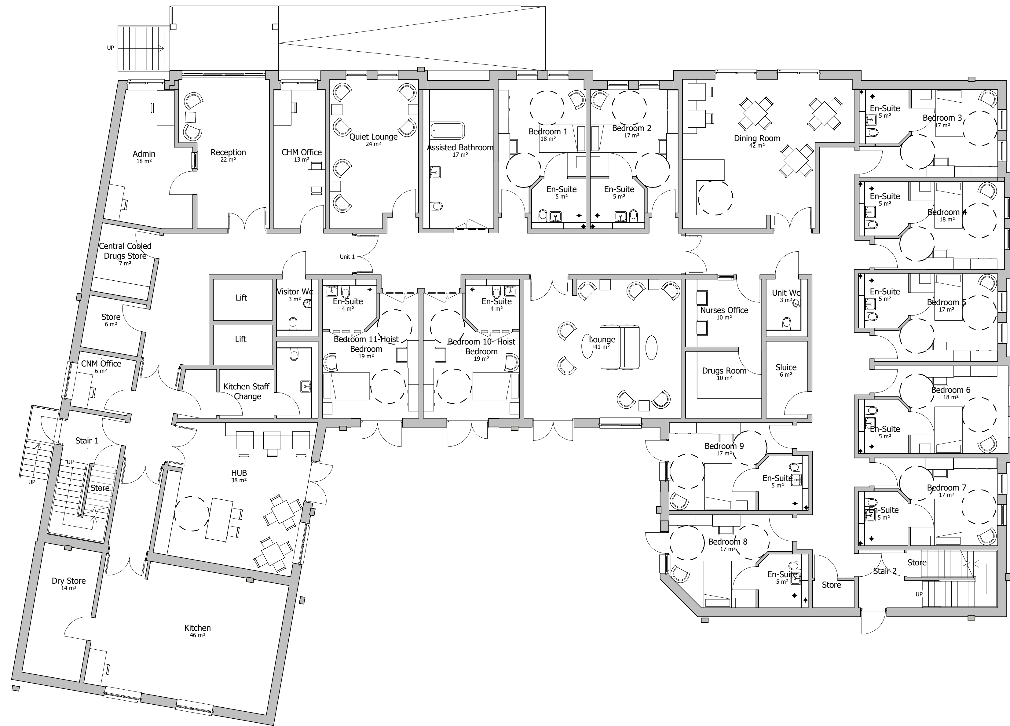
1 | Ground Floor Plan 1 : 100

C1 25.01.24 GB NM Revised Following Client Comments