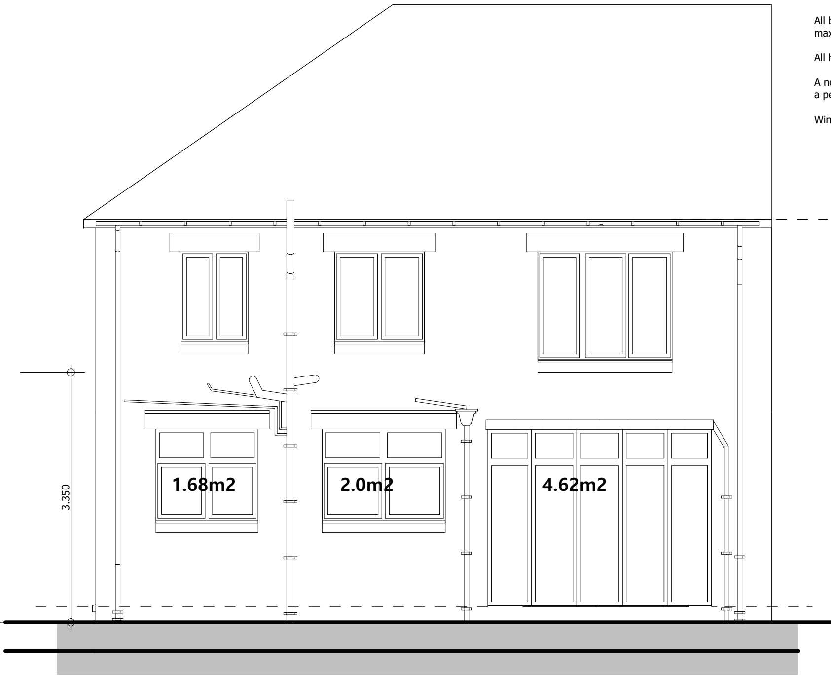
A12 Elevation 1:50