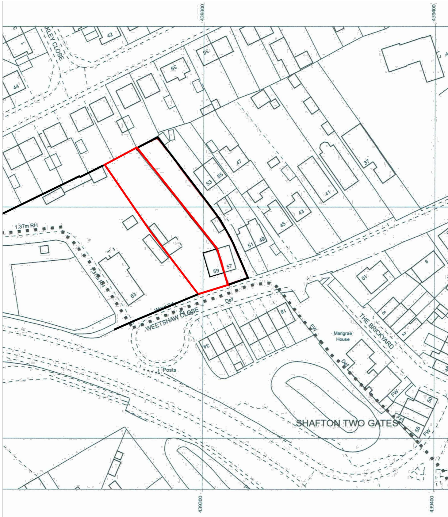
Location Plan 1:1000