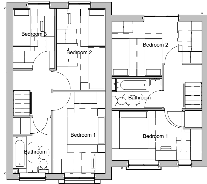
Plot 10 3B5P Plot 9 2B4P