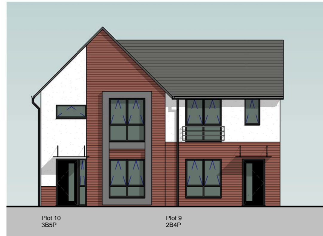
Plot 10 3B5P Plot 9 2B4P