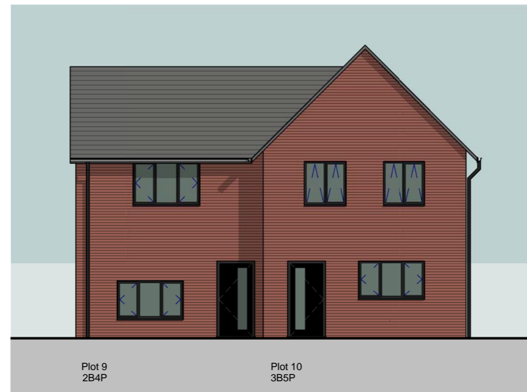
Plot 9 2B4P Plot 10 3B5P