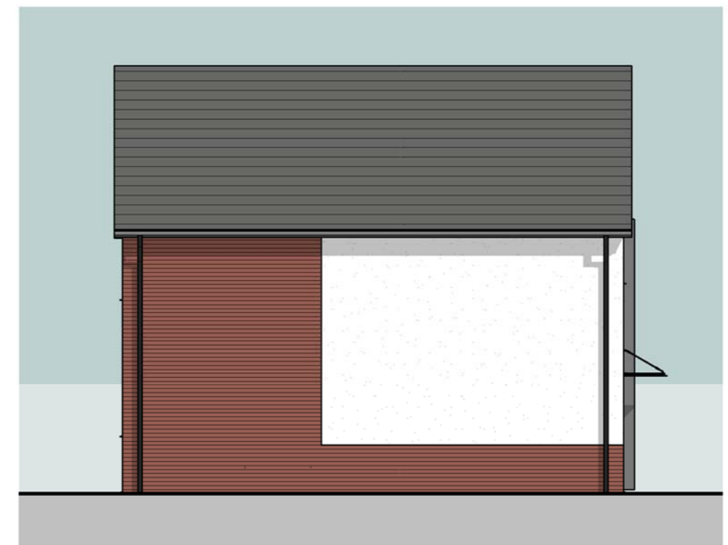
Plot 10 Side / East Elevation 1 : 100