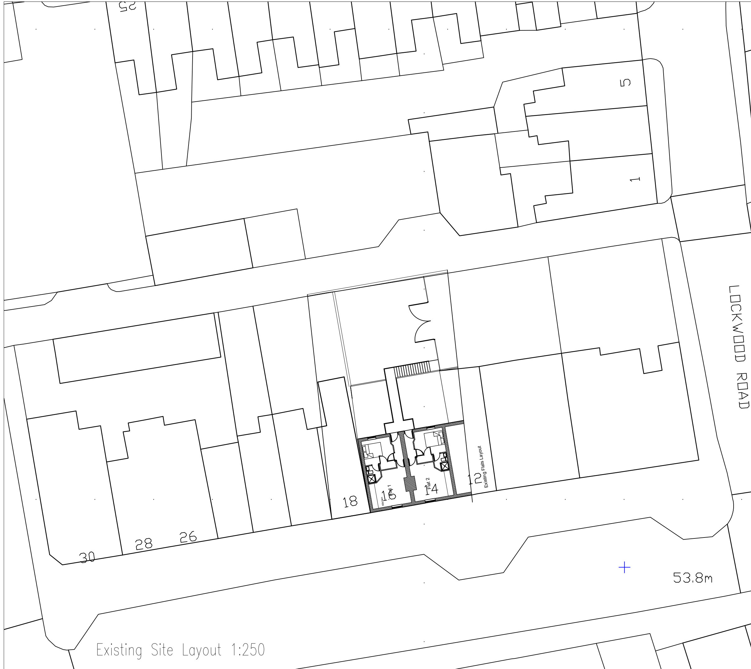
Existing Site Layout 1:250