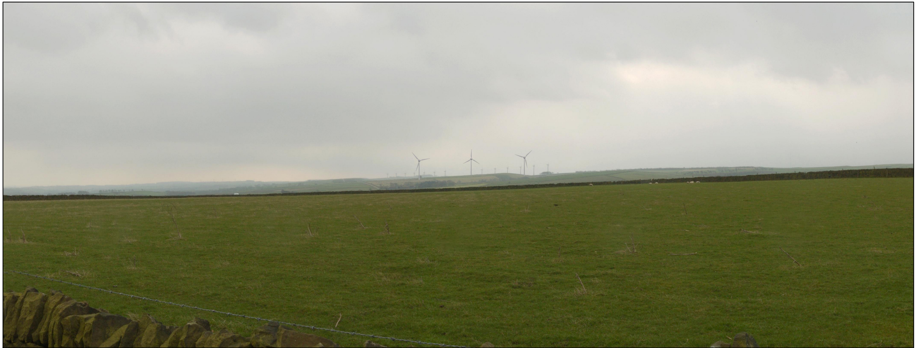
Photomontage showing proposed development from viewpoint