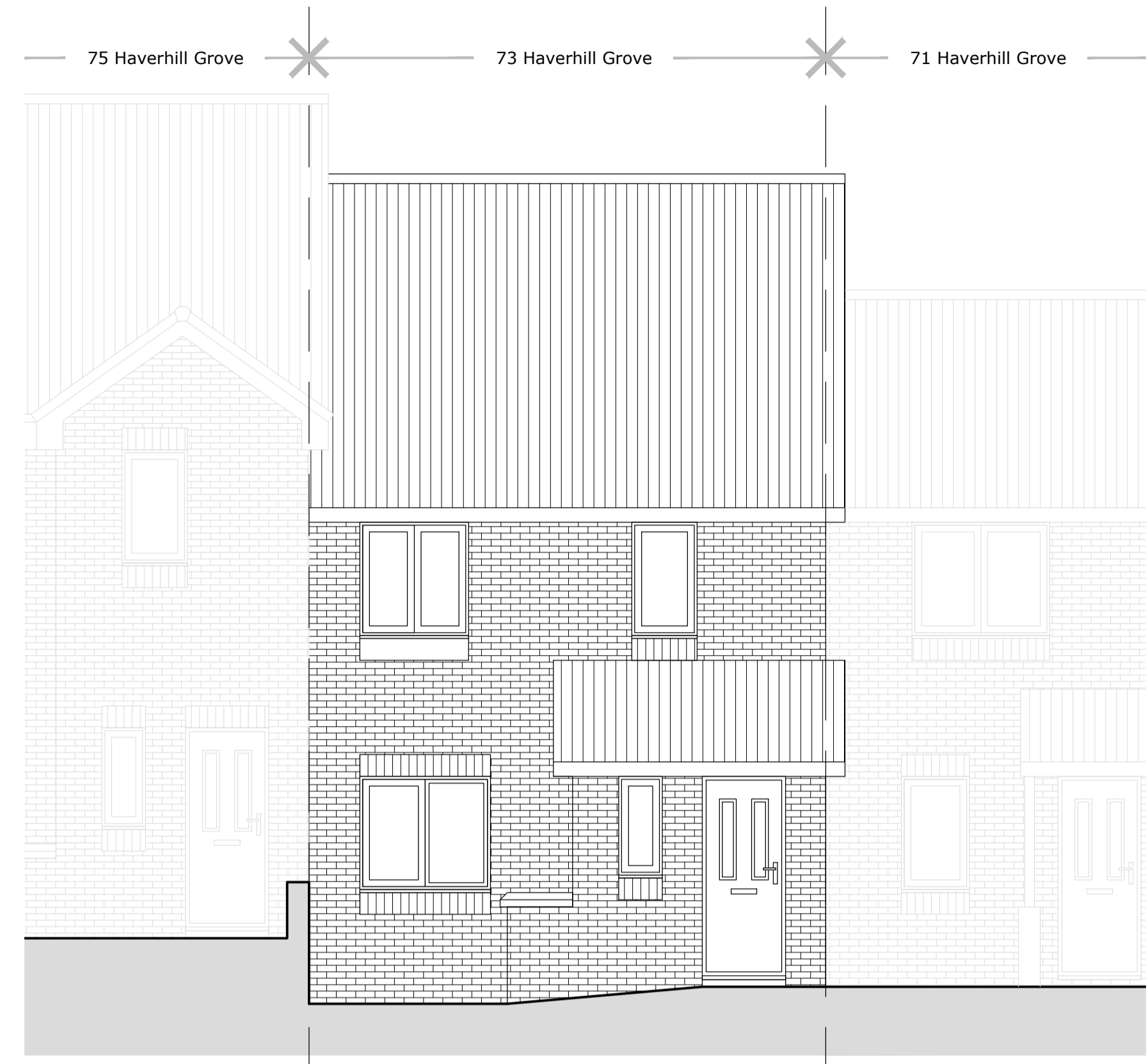
South Elevation as EXISTING 1:50