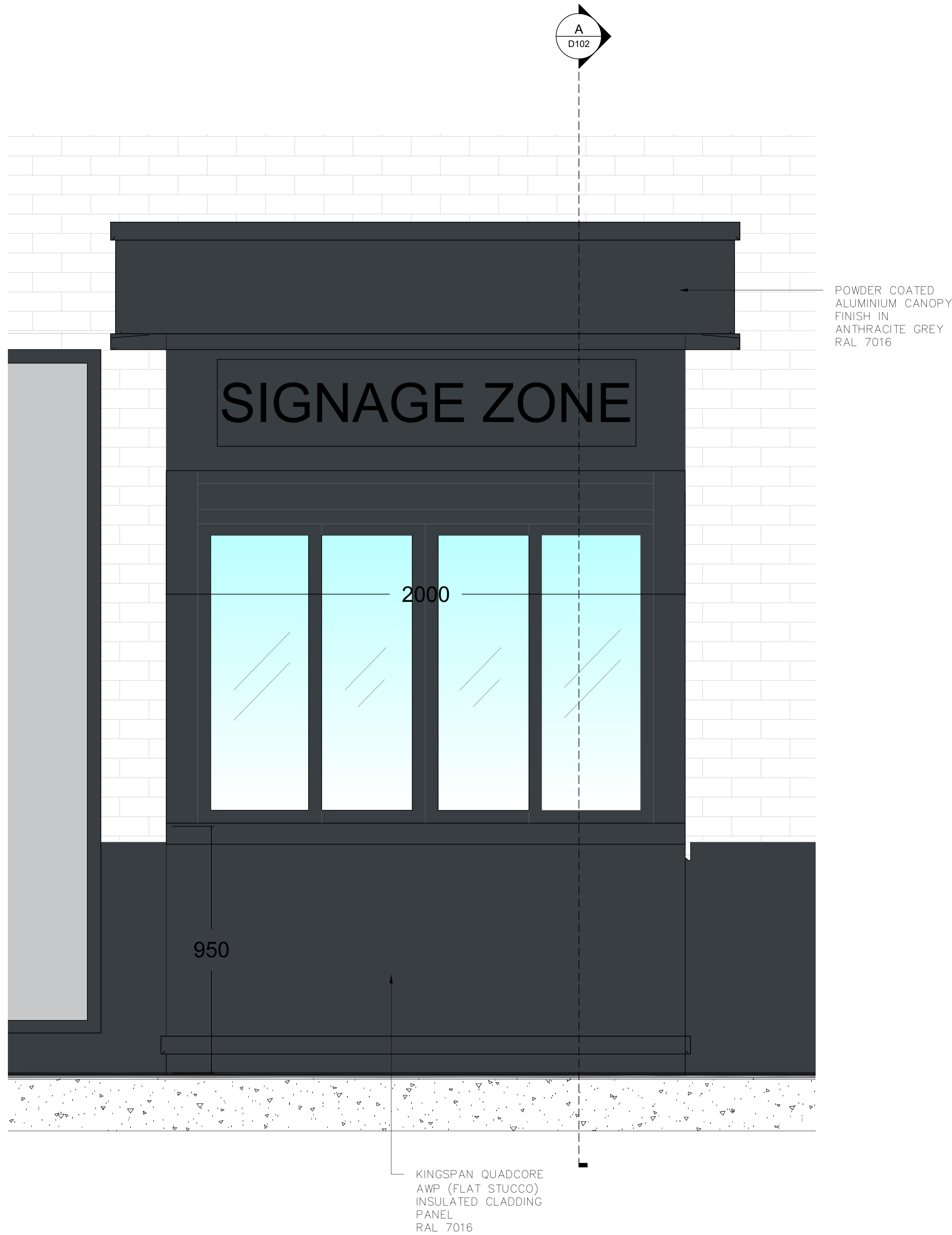
01 DETAIL: DT WINDOW SCALE 1:10@A1

ALL SIGNAGE SUBJECT TO SEPARATE APPLICATION FOR ADVERTISEMENT CONSENT