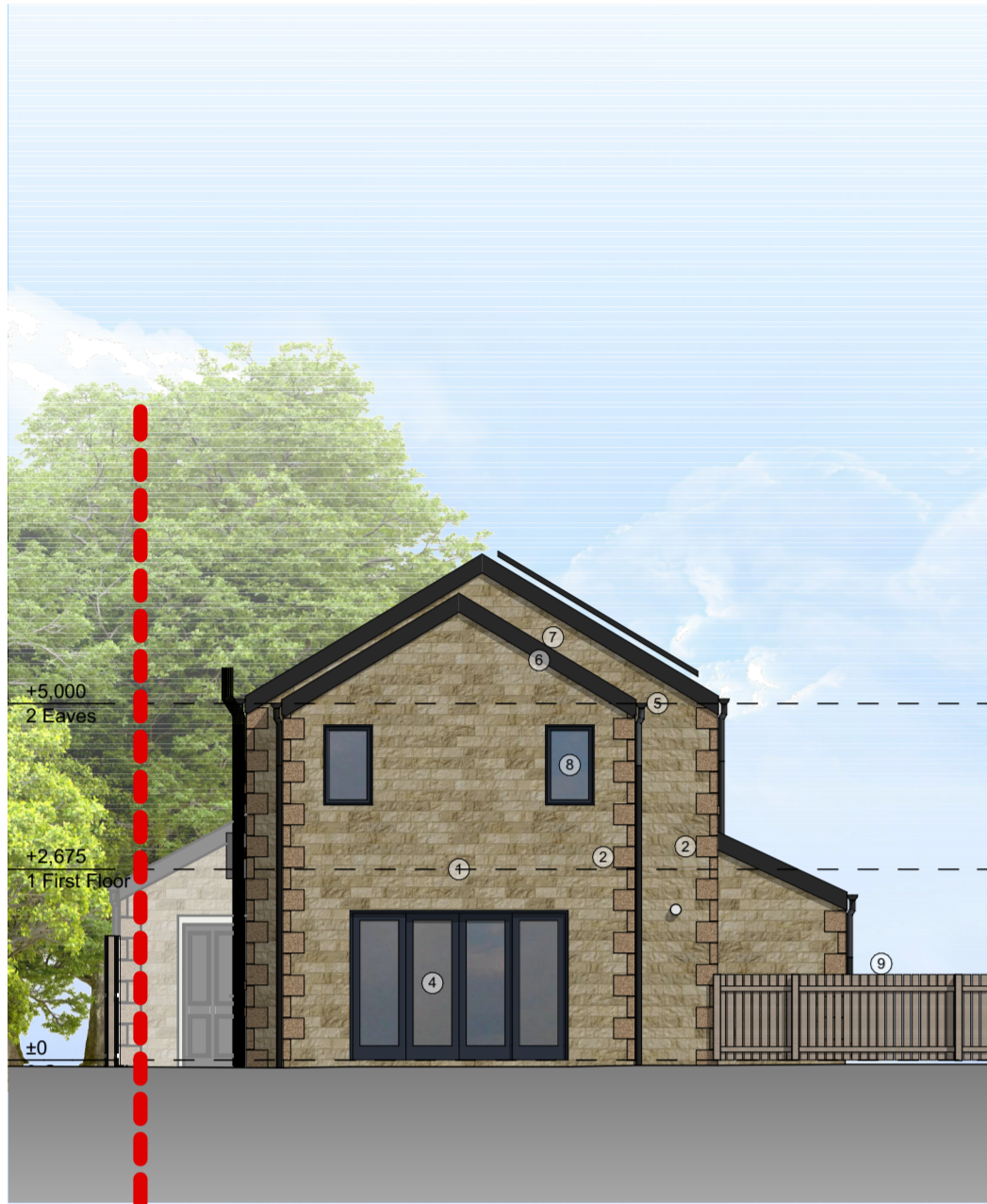
Proposed NW Elevation