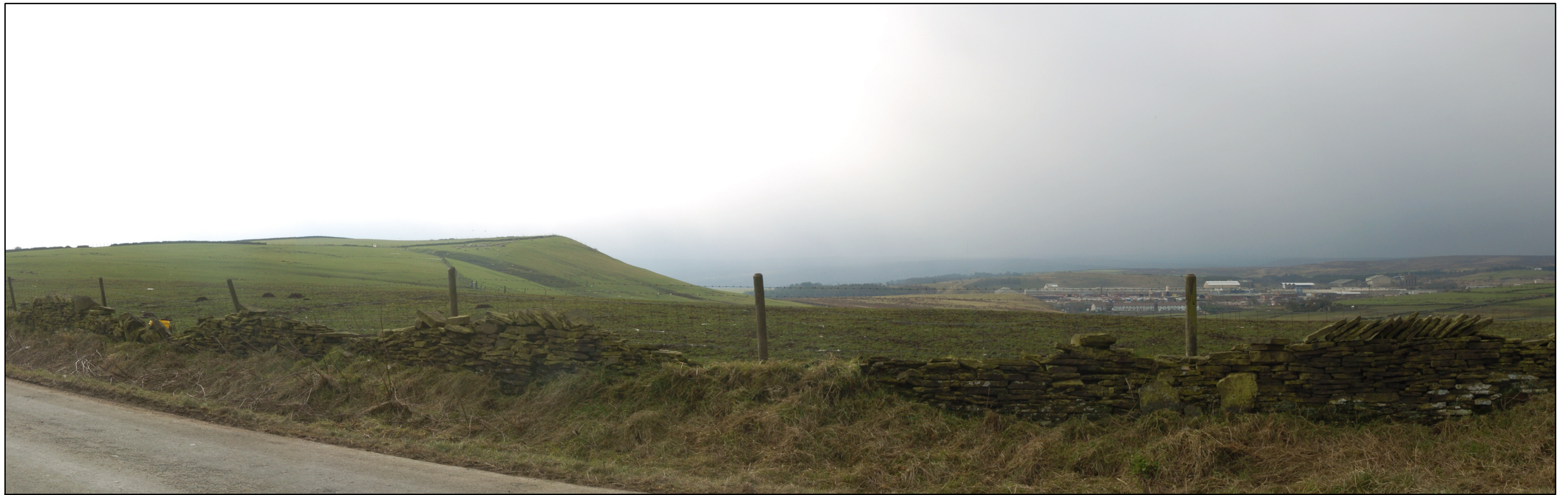
Existing view from viewpoint