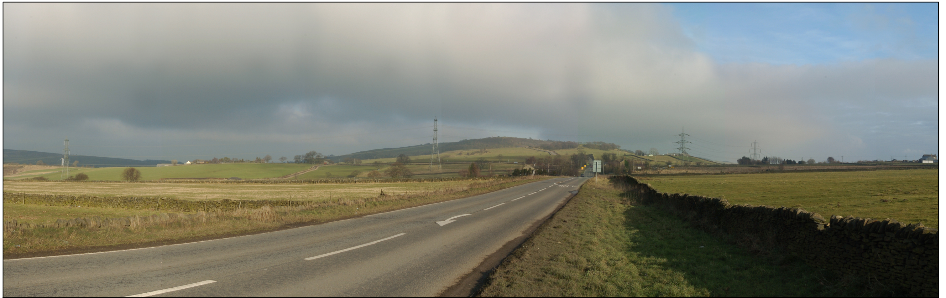
Existing view from viewpoint