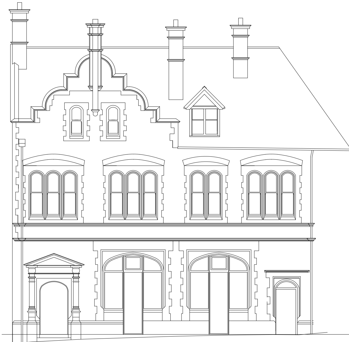
EXISTING ELEVATIONS 1 SCALE - 1/100