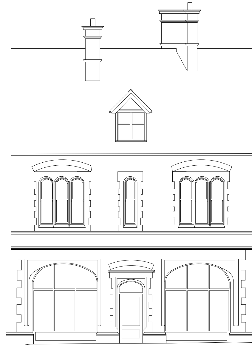
EXISTING ELEVATIONS 2 SCALE - 1/100

Do not scale from this drawing. DMA Design Management Ltd must be notified immediately should any discrepancies be found. The contractor must check all dimensions on site before construction or manufacture of materials. This drawing or any portion of it may not be reproduced without the consent of DMA Design Management Ltd.