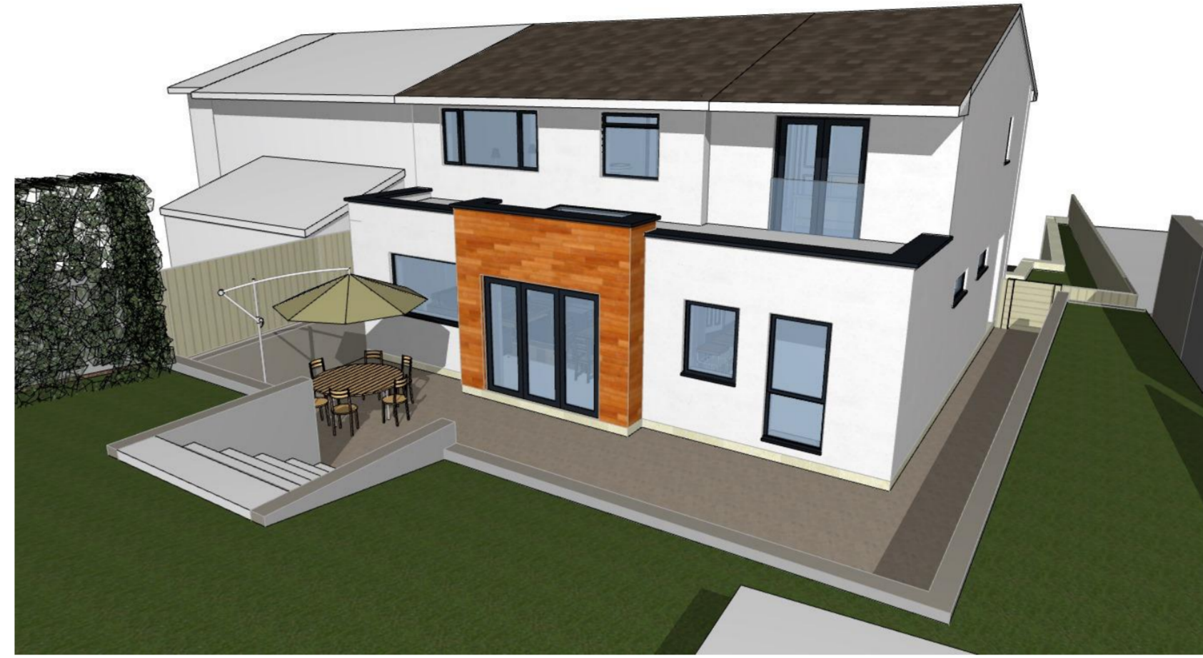
Proposed Rear 1