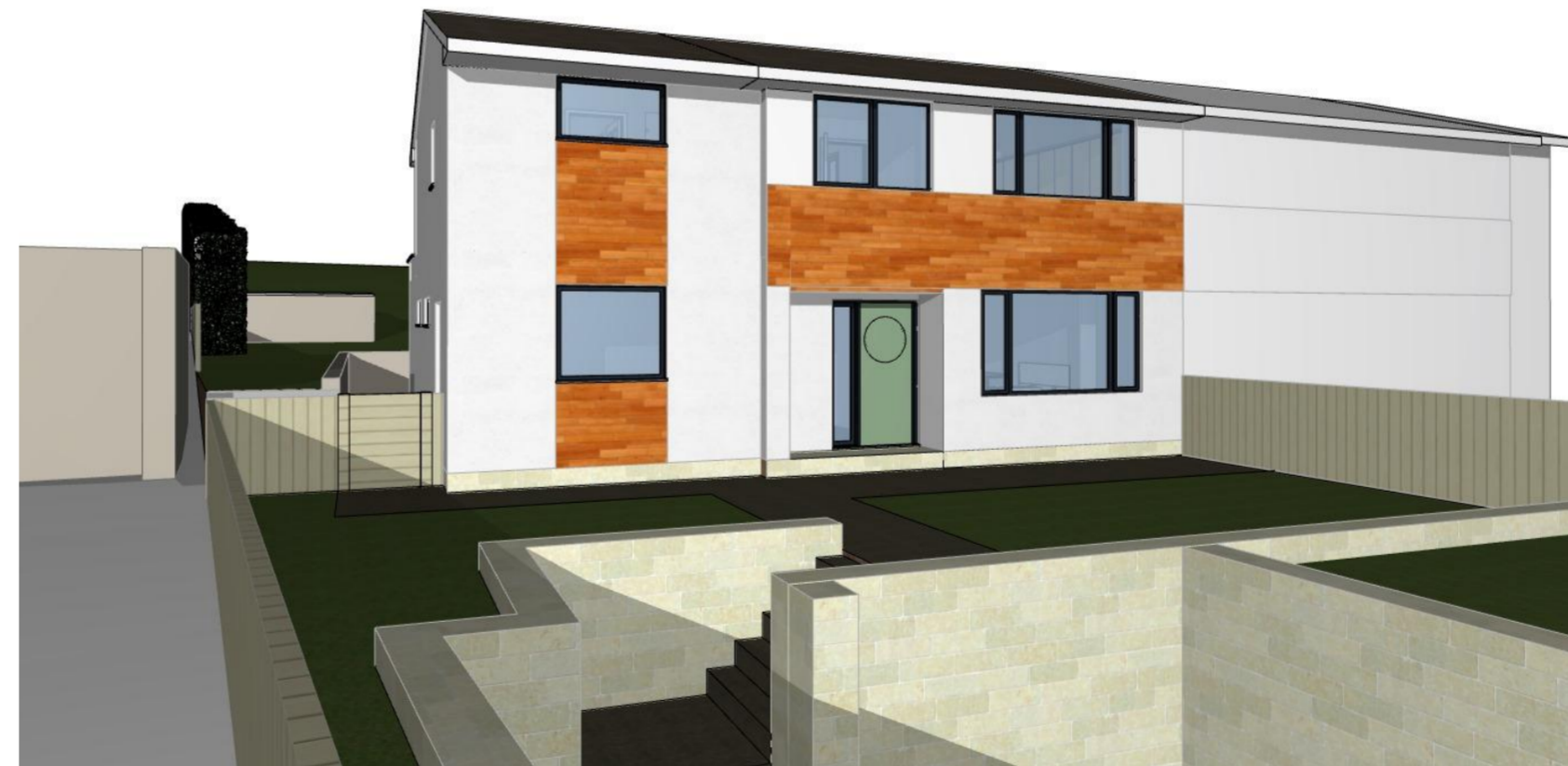
Proposed Front 2

NOTE Drawing use for status issued for only. Feasibility & Planning drawings are not intended for construction or manufacture. J Mahoney Architects Ltd cannot accept any responsibility for issues arising due to this. All dimensions to be checked on site and any discrepancies to be notified prior to the commencement of work. Do not scale from this drawing. If in doubt ask © J Mahoney Architects