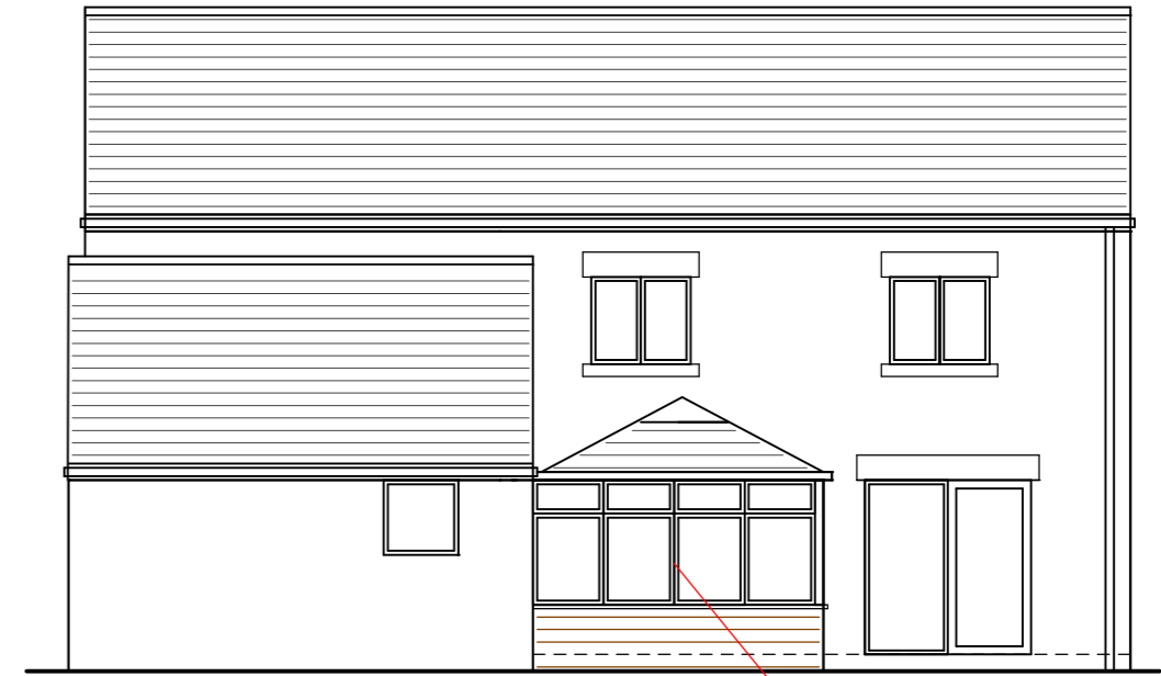
rear (west) elevation