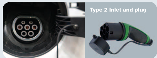
Type 2 Inlet and plug