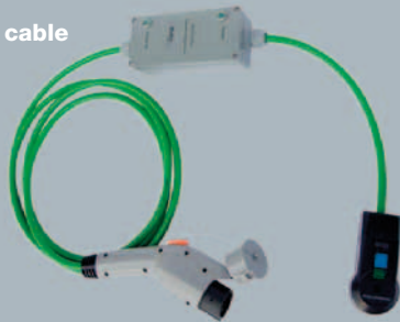
Mode 2 charging cable

It requires no communication - just the correct plugs.