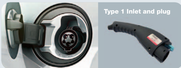
Type 1 Inlet and plug

The vehicle will have an inlet for a charging cable. It would be great if they were all the same – but they are not! Two types exist: