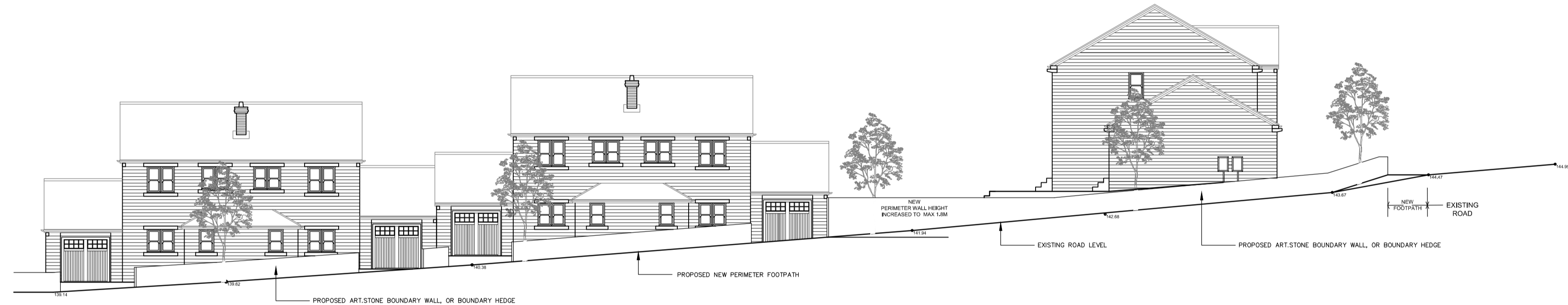
STREET VIEW - SIDE