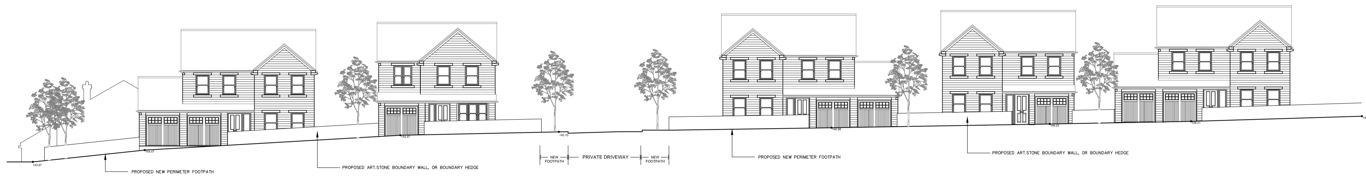
STREET VIEW - FRONT