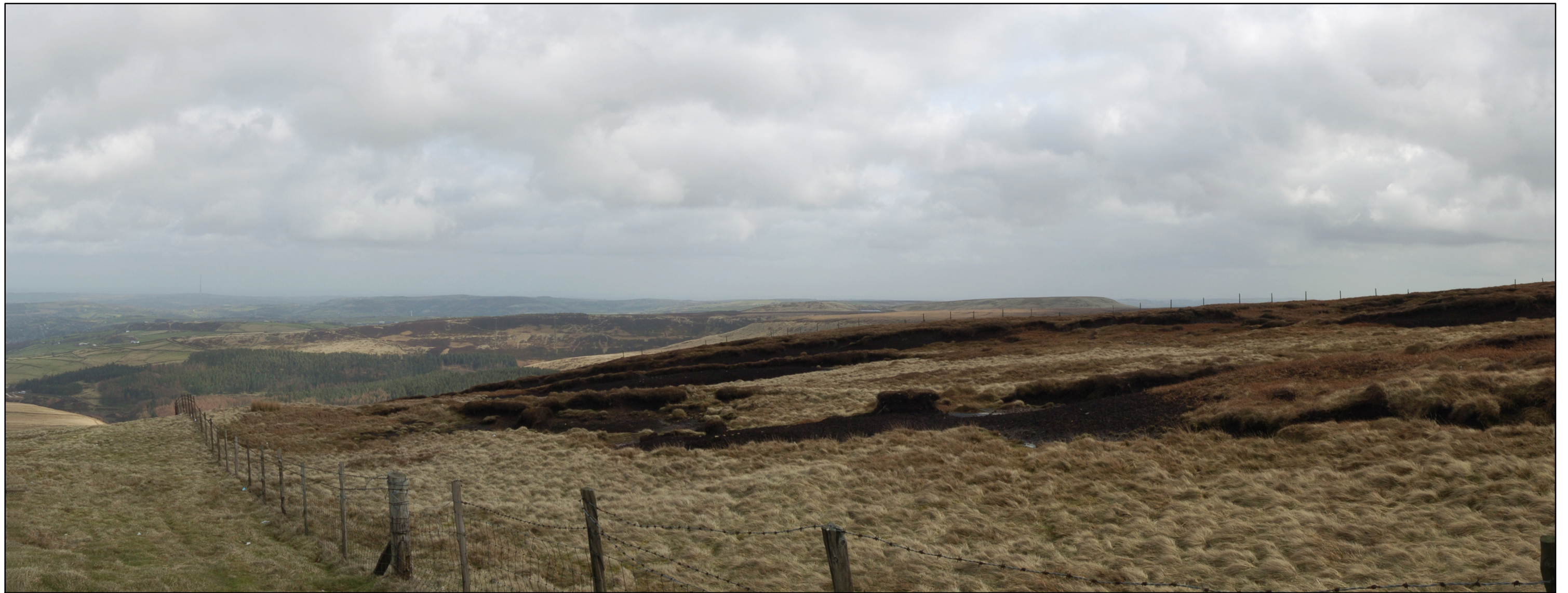
Existing view from viewpoint