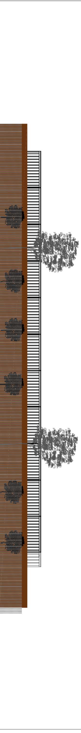
VIEW IN DIRECTION OF ARROW 'C'