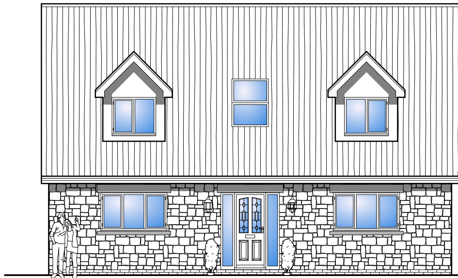
Front Elevation as Proposed.

DRAWING PREPARED BY: MARK GARFITT, ARCHITECTURAL TECHNOLOGIST. Tel: 07789 996636 Email: mark@mgarchitecturaldesigns.co.uk