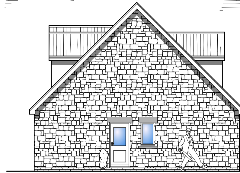
Side Elevation as Proposed.