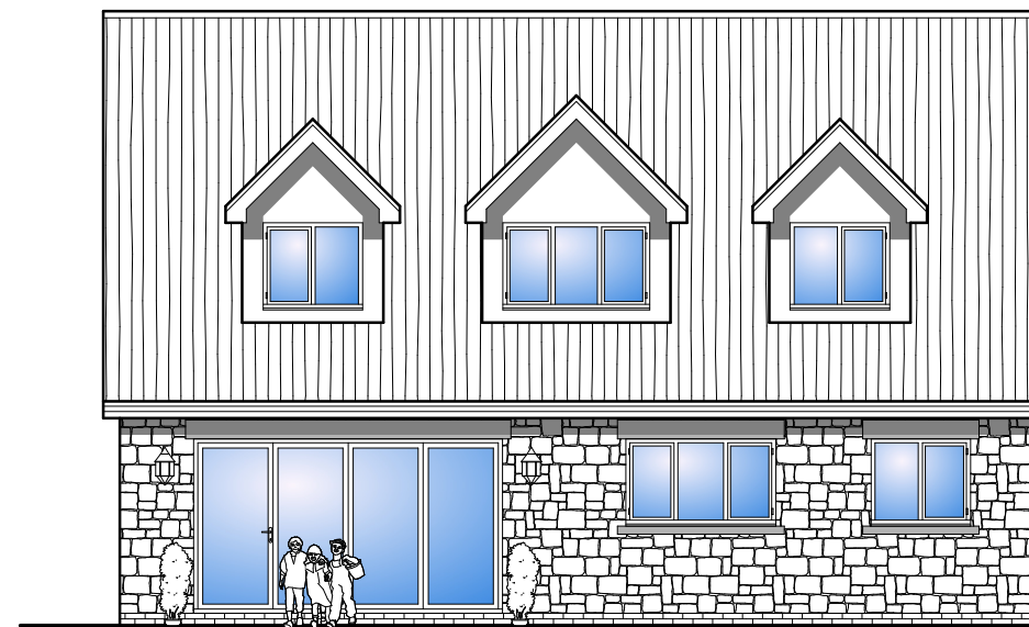
Rear Elevation as Proposed.