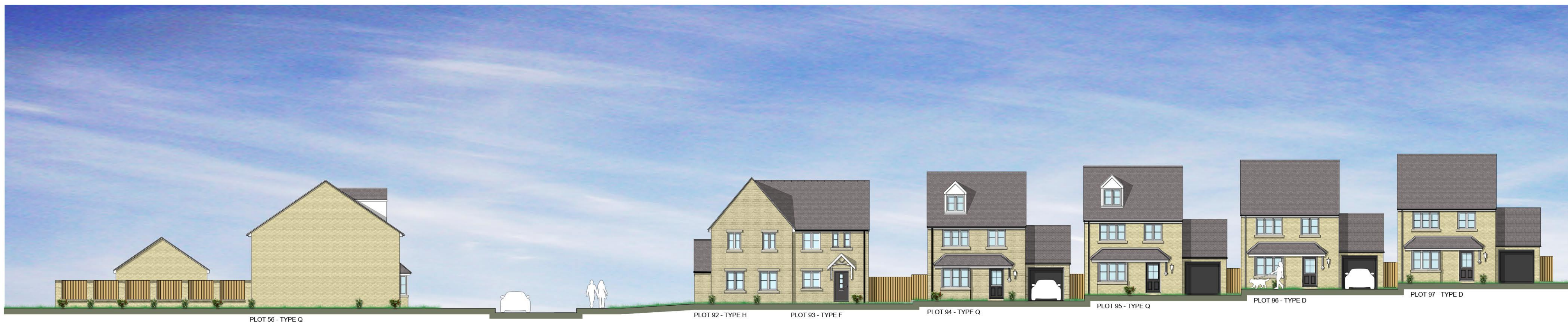
STREET SCENE D-D @ 1:200