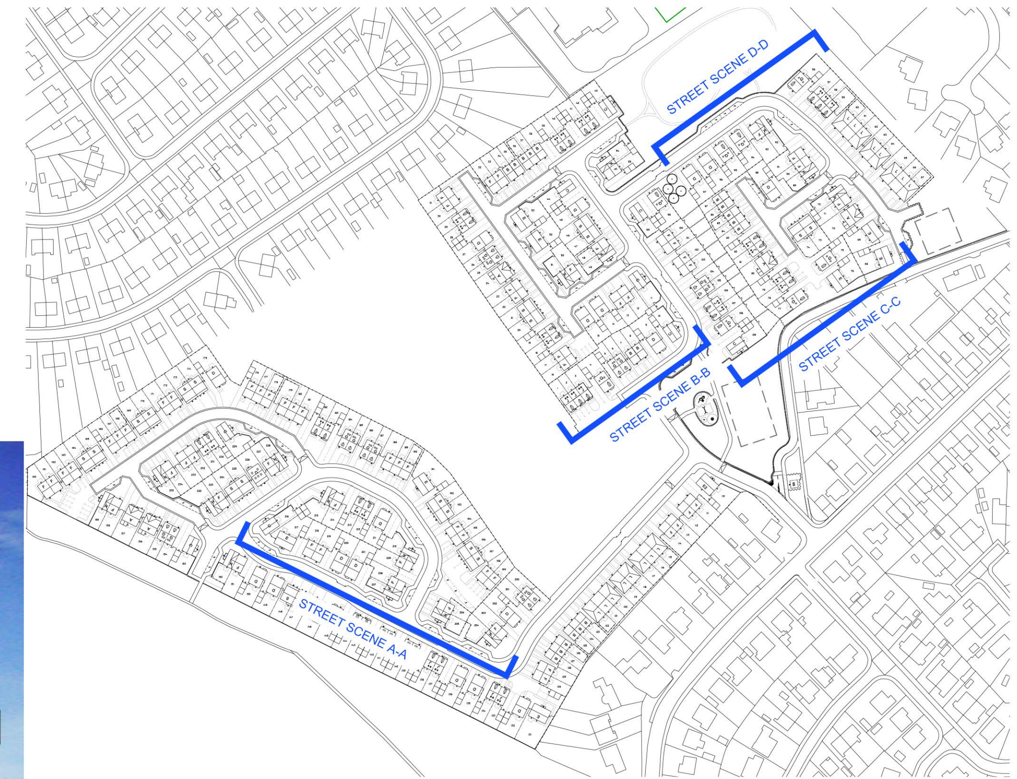
STREET SCENE KEY (NTS)