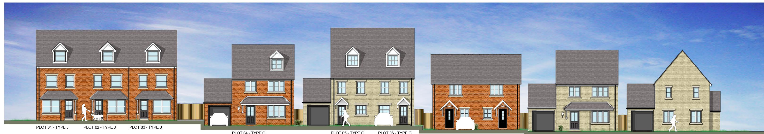
STREET SCENE B-B @ 1:200