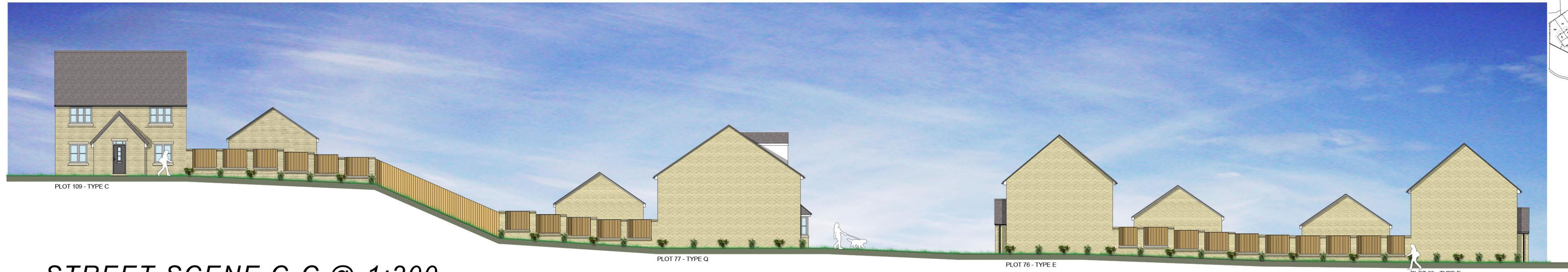
STREET SCENE C-C @ 1:200