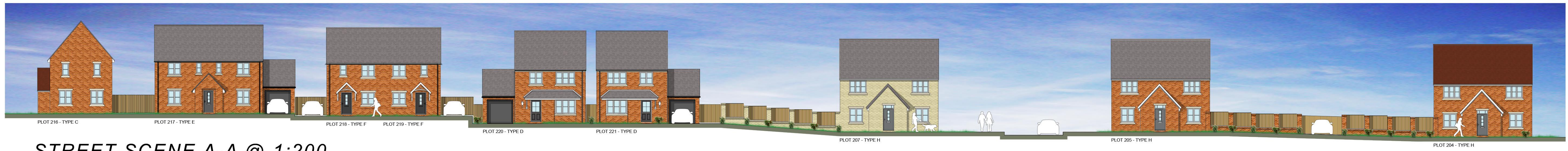
STREET SCENE A-A @ 1:200