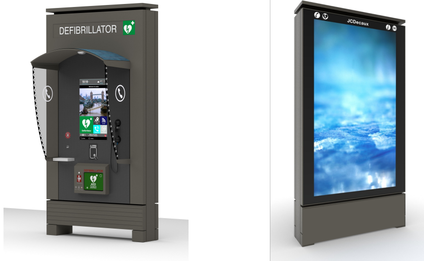
Communication Hub Renders

Community Heartbeat Trust, a registered charity that promotes greater public access to defibrillators in public spaces. Each Hub unit is equipped with a defibrillator as standard and local training is provided by the Community Heartbeat Trust, funded by JCDecaux, to ensure that the equipment can be quickly deployed in an emergency.