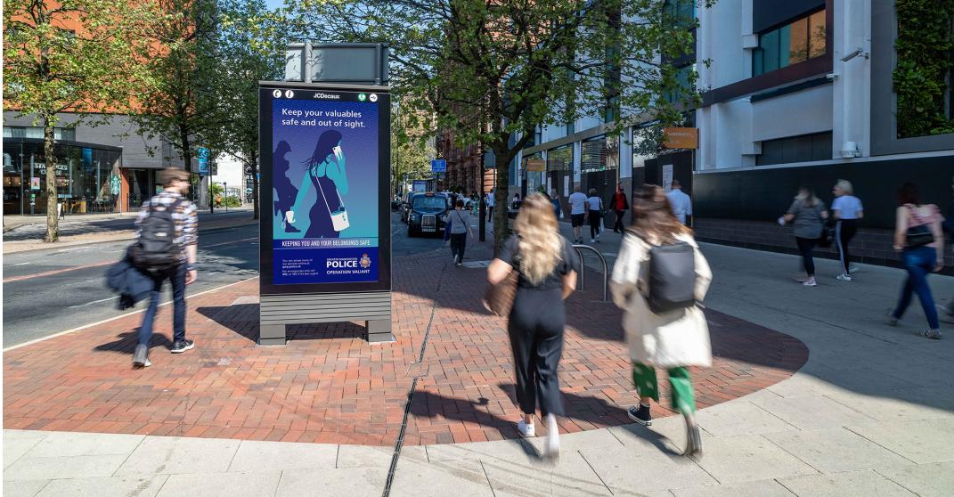
Greater Manchester Police Crime Awareness Campaign on Piccadilly, Manchester

The details of the Communication Hub unit are enclosed at Appendices B and C and the proposed locations shown on the map in Appendix A .