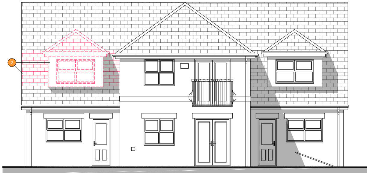
North Elevation As Existing