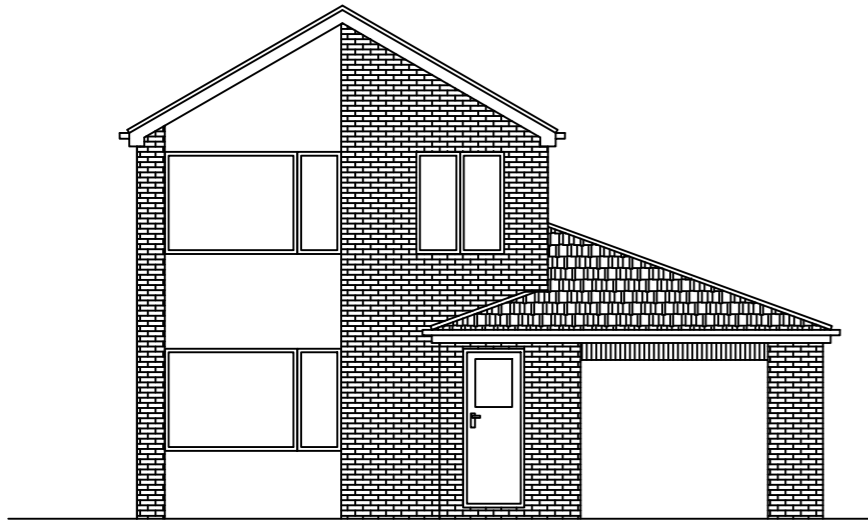
EXISTING FRONT ELEVATION SCALE 1:100 AT A3