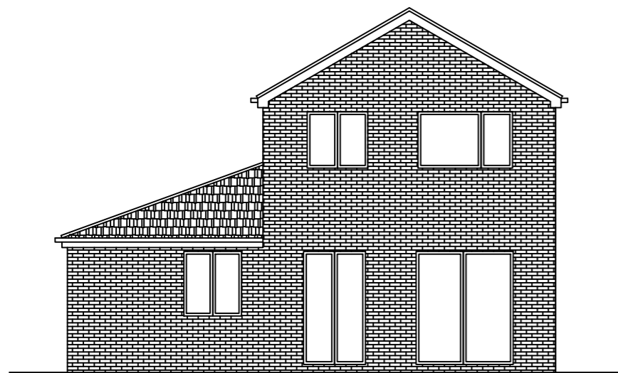
EXISTING REAR ELEVATION SCALE 1:100 AT A3