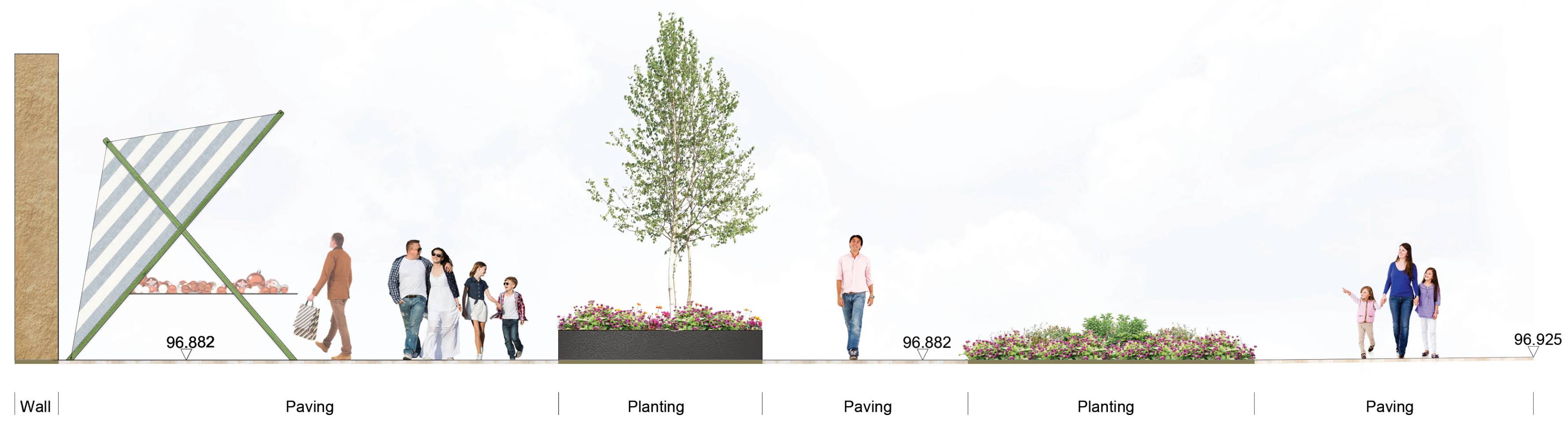
C-C Parade / Promenade 1:50