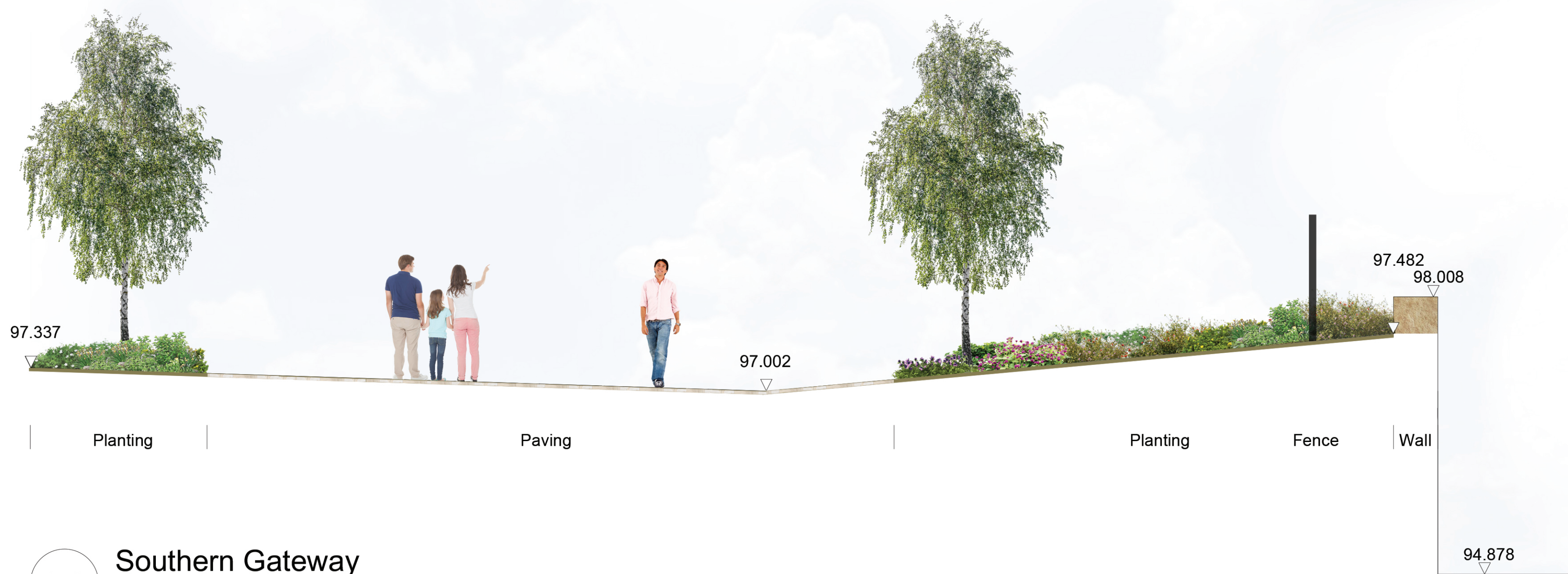
A-A Southern Gateway 1:50