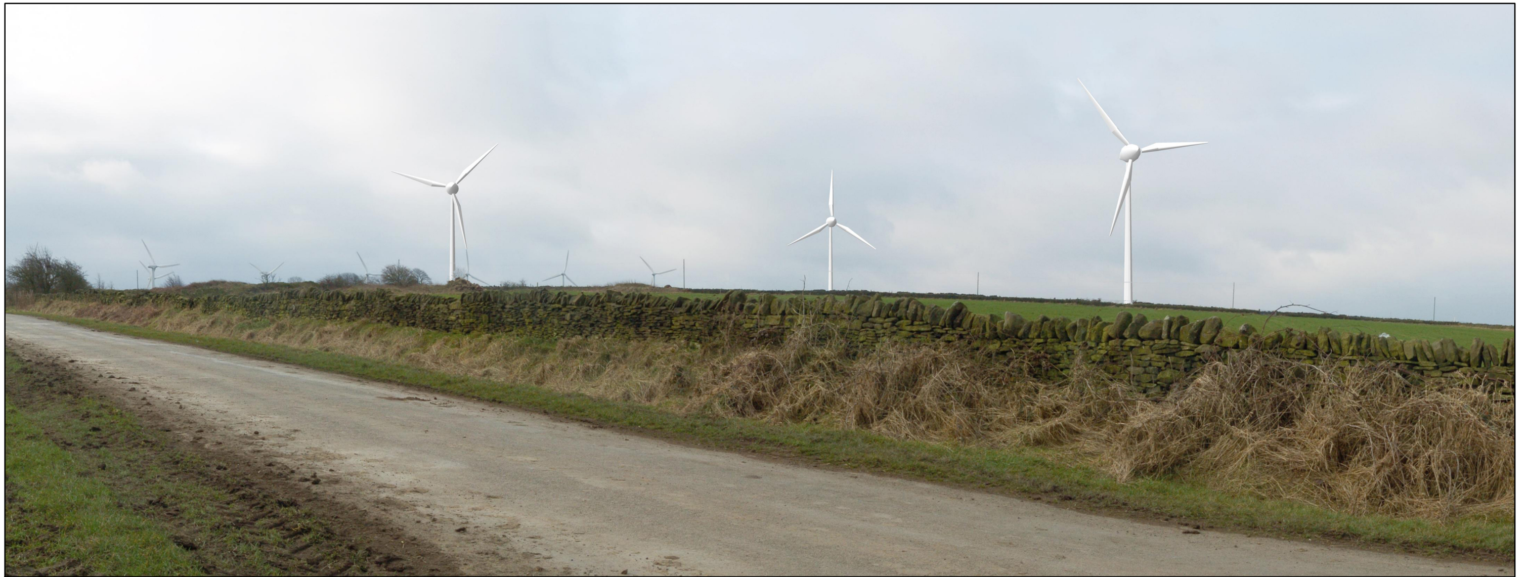
Photomontage showing proposed development from viewpoint