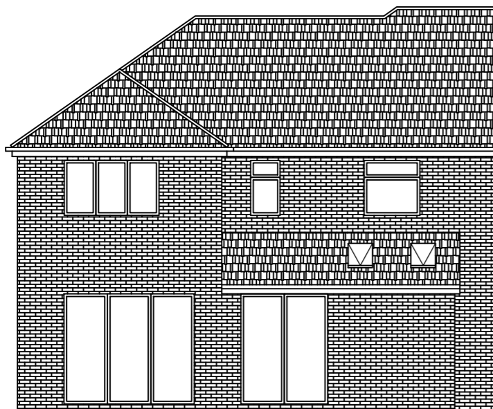
PROPOSED REAR ELEVATION SCALE 1:100 AT A3

APPROVAL INFORMATION TENDER CONTRACT CONSTRUCTION